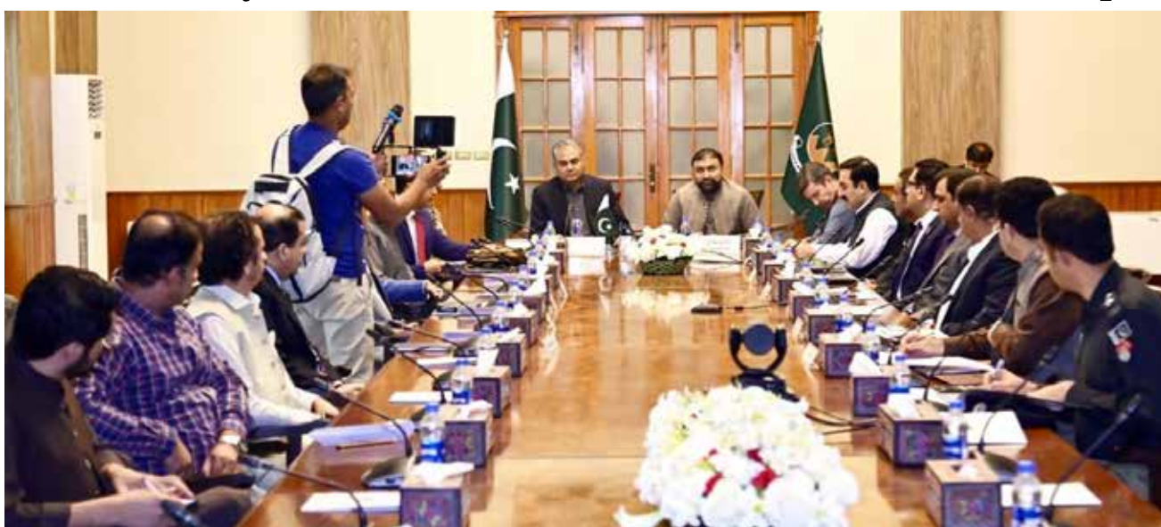
QUETTA: Federal Minister for Interior Mohsin Naqvi along with Chief Minister Balochistan Sarafraz Ahmad Bugti chairing an important law and order meeting.

He noted, "enough is enough; the government has adopted a concerted approach against miscreants. Even the enemies of Pakistan have realised that they have never received such a harsh response in the past"