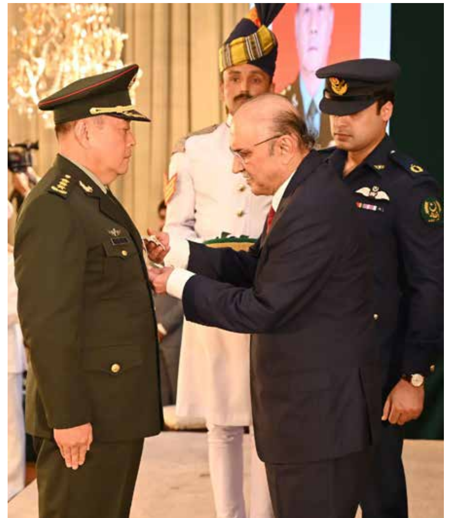
ISLAMABAD: President Asif Ali Zardari conferring the award of Nishan-i-Imtiaz (Military) upon the Commander of the Ground Forces of the People's Liberation Army of China, General Li Qiaoming, at Aiwan-e-Sadr.