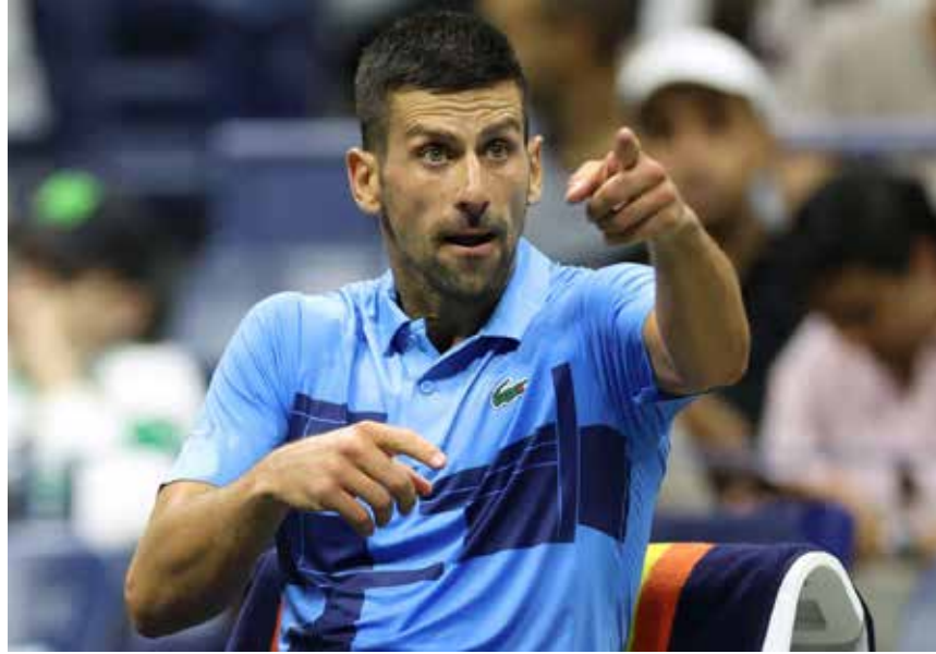
tennis I've played in a while." Four-time champion Djokovic, seeded second behind world number one Jannik Sinner, is vying to become the first man to repeat in New

NEW YORK: Coco Gauff powered into the second round of the US Open on Monday, launching her title defence with a 6-2, 6-0 victory over Varvara Gracheva as defending men's champion Novak Djokovic prepared to start his repeat bid under the lights of Arthur Ashe Stadium. Gauff, seeded third, fired 10 aces and needed just 66 minutes to beat 66th-ranked Gracheva. She saved eight break points – including two with aces in the final game. "It is definitely a lot of pressure this tournament but I'm just enjoying it," said Gauff, who is seeded third behind world number one Iga Swiatek and Aryna Sabalenka. "Last year was incredible, so I'm just bringing those vibes and whatever happens, happens." Gauff has battled through an erratic season since capturing her maiden major last year and her tune-up tournaments saw her fall in the third round at Toronto before she crashed out of her first match as the defending champion in Cincinnati. "The last few weeks have been a little bit tough," Gauff said. "But today was I think the best