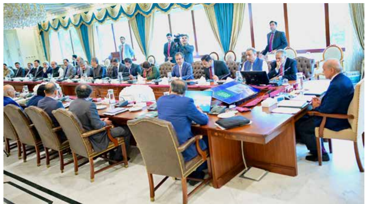
ISLAMABAD: Prime Minister Muhammad Shehbaz Sharif chairs a review meeting regarding economic growth and investment.