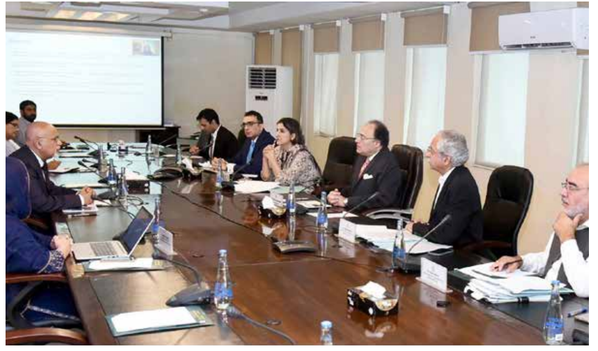
ISLAMABAD: Federal Minister for Finance and Revenue Senator Muhammad Aurangzeb chaired a review meeting with representatives from Joint Venture Investment Companies, including Pak-Brunei Investment Company Limited (PBICL) and Saudi-Pak Industrial and Agricultural Investment Company (SPI&AIC).