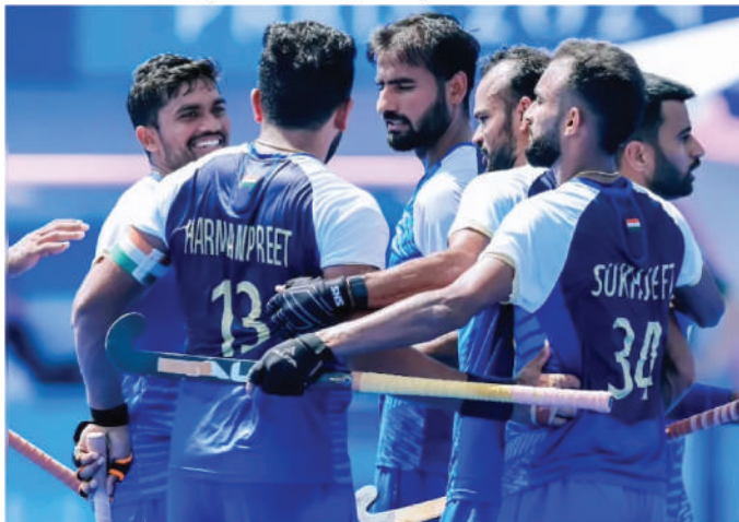
of my life," Besterra said. "We had pointed to this day in our calendar, and now we are so happy. We have to enjoy today and tomorrow we will see (face) our opponents and we will see how to beat them." The final penalty score by substitute Raj Kumar Pal put the once dominant side in the semifinals for the second Olympics in a row, after they won bronze in Tokyo, as they look to recapture the gold medal that has eluded them since 1980.

PARIS: Hockey Olympic India beat England 4-2 to qualify for the semi final. England is No 2 in world ranking and India No 7. India beat England on penalty shootouts. Both India and England put a tremendous game in the allotted time. Both teams scored one goal each in the allotted time. England is No 2 in the world hockey rankings while India is No 6. A top seed India had beaten World No 4 Australia to qualify for the quarter final. India defeated Australia for the first time after 1972. Eighth-ranked Spain upset reigning champions Belgium 3-2 in the men's hockey quarterfinals at the Paris Olympics on Sunday as skipper Marc Minillas netted a crucial third goal with three minutes to go before the defence obliged an attempted comeback. Spain had not made it past the last eight since Beijing 2008, while Belgium reached the last two Olympic finals, with several of their players holding gold and silver medals from the Tokyo and Rio Games respectively. Forward Jose Maria Besterra opened the scoring in the 6th minute by converting a goalkeeper deflection off a blistering pass from defender Joni Bonastre but the lead did not last long as Belgium's Arthur de Sloover equalised a minute later. Forward Marc Reyne put Spain back in front after 55 minutes with a strike from the field and Maralles stretched the lead before Alexander Hendrickx pulled a goal back. I think today is the best day