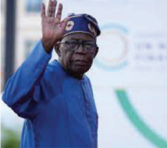
and destruction tear our nation apart," he added. In office since May 2023, Tinubu defended his economic reforms, which have included a partial end to petrol and electricity subsidies and devalu-

Abuja : President Bola Tinubu has told Nigerians protesting against a cost of living crisis that he has "heard" them as he called for the suspension of the demonstrations and an end to "bloodshed".