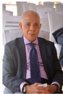
Embassy of Morocco in Islamabad. It gives business owners the confidence to pursue bigger dreams,

ing together". Ambassador Karmoune said, in all of its manifestations, technology is now the primary component of contemporary corporate strategy. Cutting-edge developments are constantly changing the face of commerce, from blockchain altering supply chains to artificial intelligence transforming customer experiences. This integration is about more than just adopting the newest technology; it's about using innovation to boost production, increase efficiency, and open up new business opportunities. Around the world, industries, economies, and cultures have changed as a result of the convergence of business and technology. The current business landscape is characterized by both dynamic and problematic aspects, ranging from the disruptive potential of digital platforms and cybersecurity to the revolutionary advancements in blockchain and artificial intelligence. This conference offers a priceless chance to investigate these developments, exchange perspectives, and set forth a collective agenda. However, the union of technology and business goes beyond improving operations. It cultivates a resilient and adap-