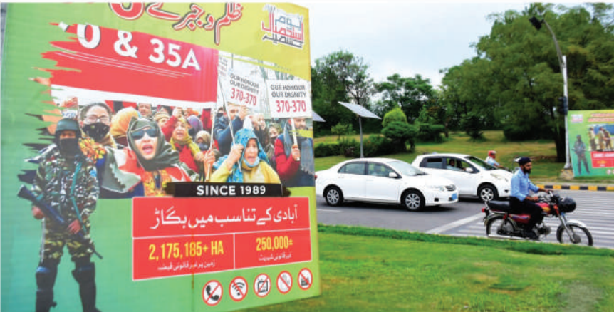
ISLAMABAD: Posters and flags displayed on Constitution Avenue, urge people to mark the Youm-e-Istehsal (Exploitation Day), Jammu Kashmir falling on 5th August. In world over, August 5 is observed as Kashmir Exploitation Day by the people of Kashmir as on this black day, the fascist Modi regime without any legal justification had illegally abrogated the Articles 370 and 35A in 2019, thus abolished the special status of IIOJK unilaterally.