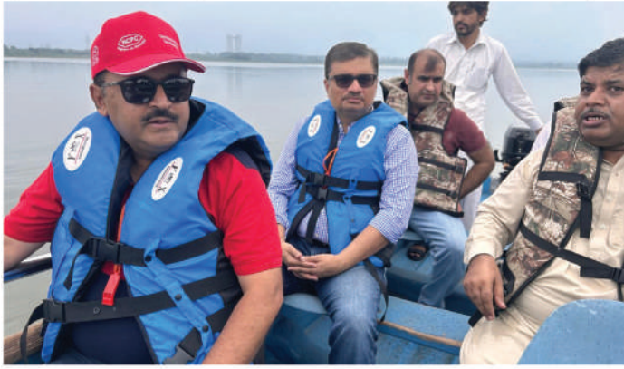
address the issue on the permanent basis and prevent the contamination of water, an everlasting solution of this chronic issue. The occurrence of fish mortality reported by the Watch and Ward Staff deputed at the dam.

It was observed that mortality took place in the last week of July and the dead fish has been removed while the situation has improved. Furthermore, CDA has initiated the process and invited expression of interest for sewerage treatment plant upstream to