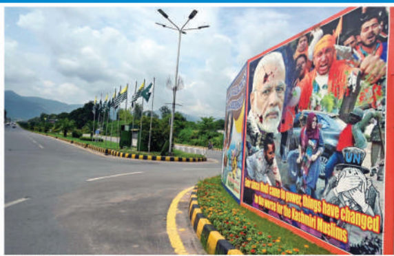
ISLAMABAD: To observe Youme-e-Ittehsal banners displayed against the Indian government decision of revoking the special status of disputed territory on Indian occupied Kashmir.