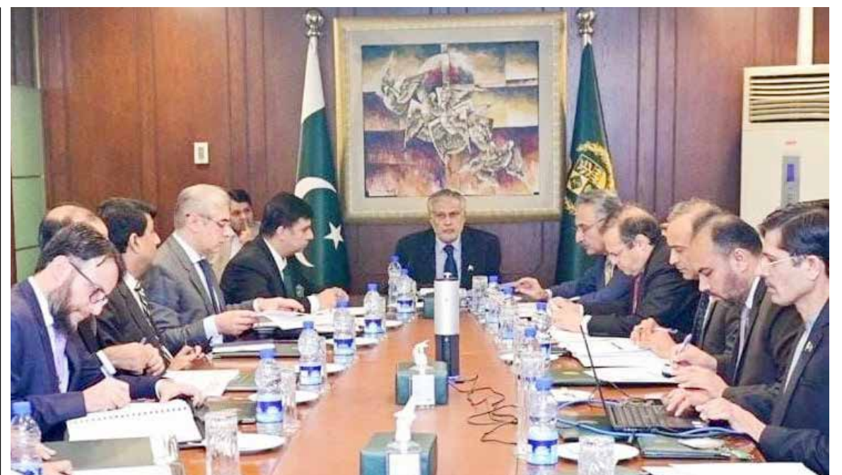
ISLAMABAD: Deputy Prime Minister and Foreign Minister Ishaq Dar 50 chairs an Inter-Ministerial to review preparations for the forthcoming 12th Session of Joint Ministerial Commission (JMC) with the United Arab Emirates.