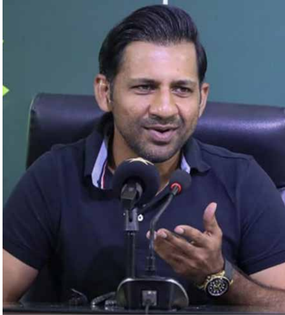
of 150 players. "We will focus on the development of U19 players and with my experience, we will try to

LAHORE: Former Pakistan captain Sarfaraz Ahmed has opened up on his future as a player after being named as the mentor of the Dolphins side for the Champions One-Day Cup, scheduled to be held in Faisalabad from 12-29 September. Sarfaraz is the active Pakistan player out of the five mentors announced for the Champions Cup. The 37-year-old has rated this as a great learning opportunity for him and confirmed that he will be available for domestic and international duties. "This is a great opportunity for me. It's also a chance for me to learn. I will strive to bring forward good players who can represent Pakistan," he said in a presser. "I will be available for the Pakistan team. When I will have domestic duties, I will fulfill them. Whenever I am selected, I will be available. "With time, everything will fall into place. Right now, I feel I can still play. I will continue to play as long as I can," he added. Pakistan recently slumped to a 2-0 Test series defeat to Bangladesh and Sarfaraz has asked fans to support. "My message to the fans is that this Pakistan team will make a comeback. Support your players. Support your players in the Champions Cup." Sarfaraz revealed how he picked his side for the forthcoming competition. "I have selected the team while working closely. We have chosen players from a draft