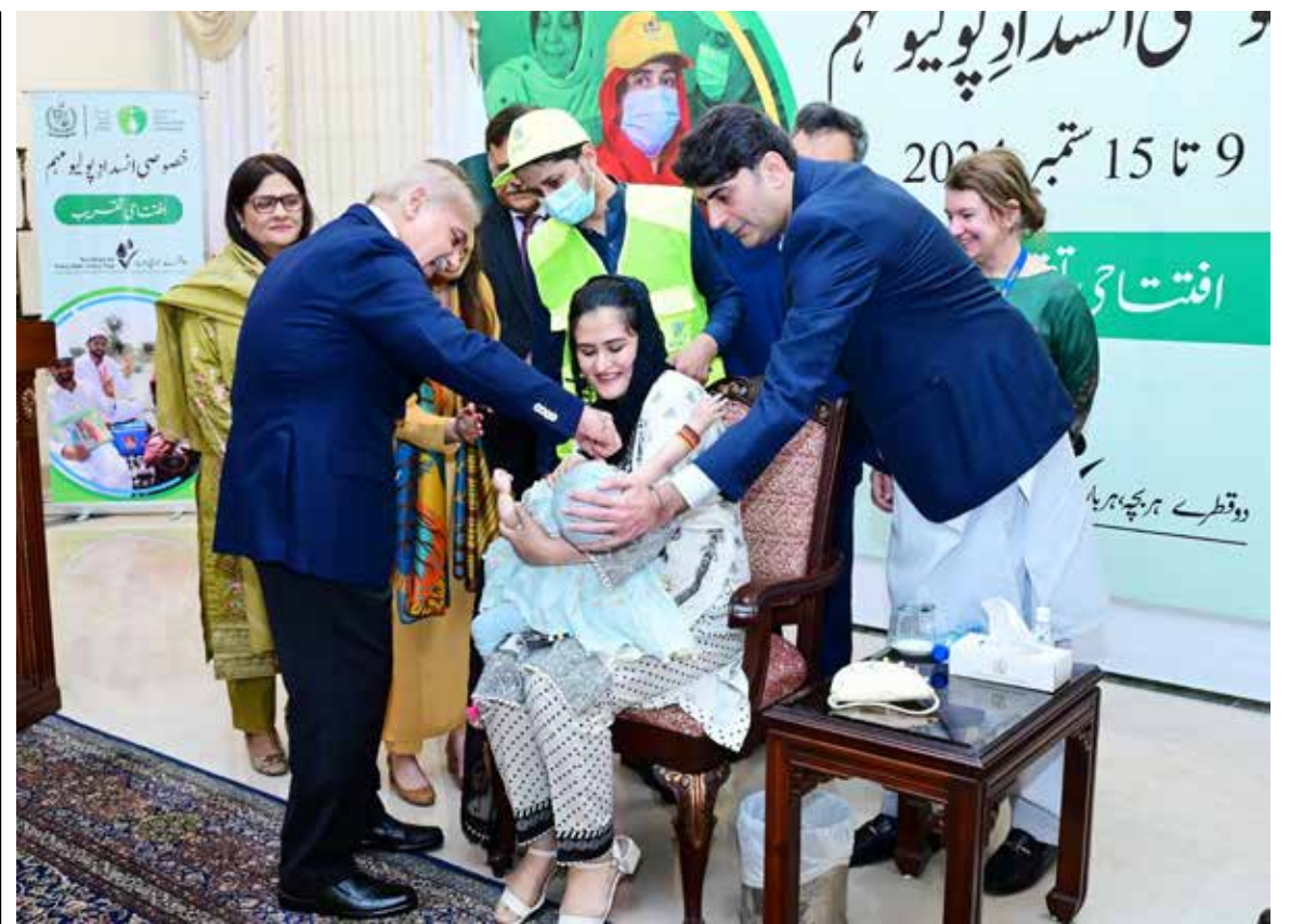
ISLAMABAD: Prime Minister Shehbaz Sharif administering polio vaccination to children to kickstart countrywide Special Anti Polio Campaign. Islamabad, 8 September, 2024.