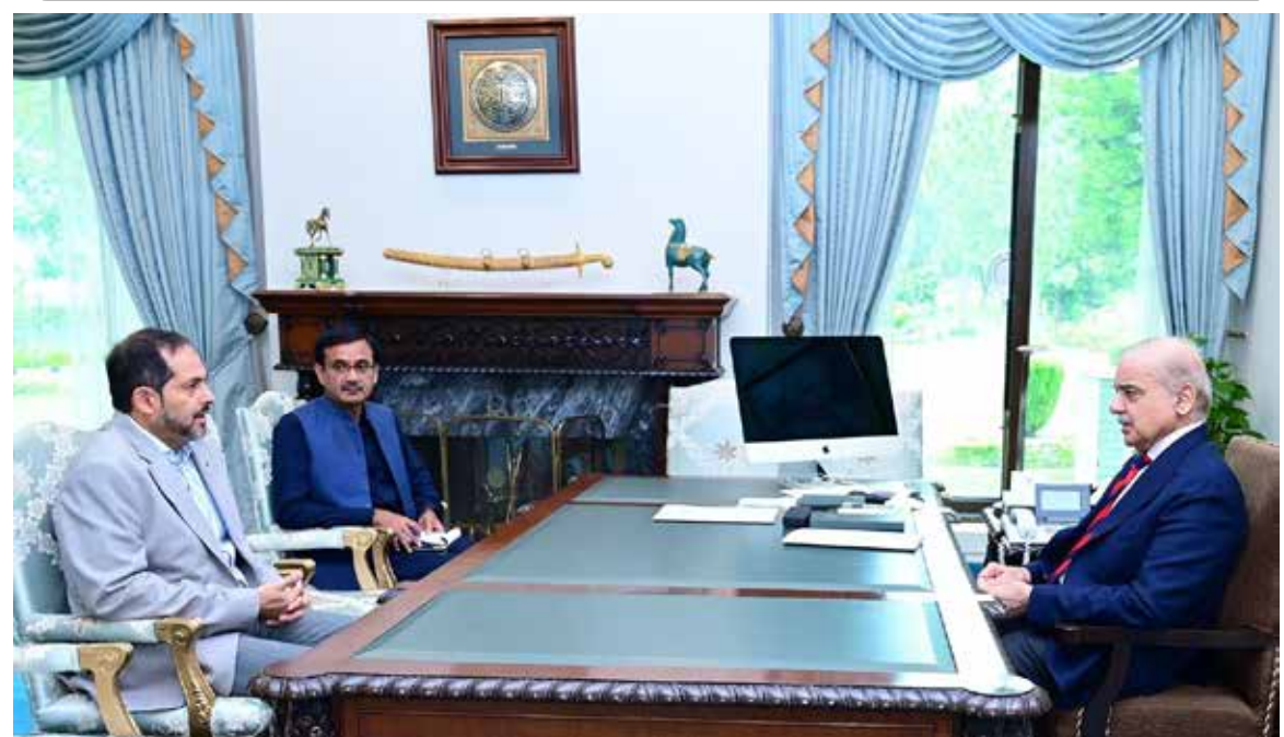
ISLAMABAD: Minority leader MNA Isphanyar Bhanadara calls on Prime Minister Mian Muhammad Shahbaz Sharif.

and respect. The arrest of this massive network is a major victory for law enforcement agencies in the fight against human trafficking.. Federal Interior Minister Mohsin Naqvi appreciated the intelligence agencies and FIA Lahore for this successful operation. He said that this operation is an important milestone in Pakistan's crackdown against human smuggling. He emphasized that such operations will be continued to curb human tray and the mafia involved in human smuggling will be dealt with iron hands.