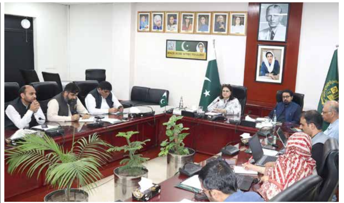
ISLAMABAD: Senator Rubina Khalid, Chairperson of the Benazir Income Support Programme (BISP), conducted a live E-Katcheri session today at BISP Headquarters. During the session, Senator Rubina Khalid directly interacted with beneficiaries via BISP's official Facebook account, listening to their concerns and issuing immediate directives for the resolution of their complaints.

that protests and gatherings have exacerbated the situation, making life difficult for everyone. With Pakistan hosting the Shanghai Cooperation Organisation's summit next month, diplomats have expressed concerns about frequent road closures due to protests, questioning the government's ability to secure its capital. The ICCI leaders termed the legislation a "breath of fresh air" for Islamabad's business community, hoping it will stimulate and regulate business activities in the city. The ICCI leadership warmly thanked Senator Irfan Siddiqui for his pioneering effort in promoting a peaceful and business-friendly environment through the introduction of the Peaceful Assembly Law, which will greatly benefit both citizens and the business fraternity.