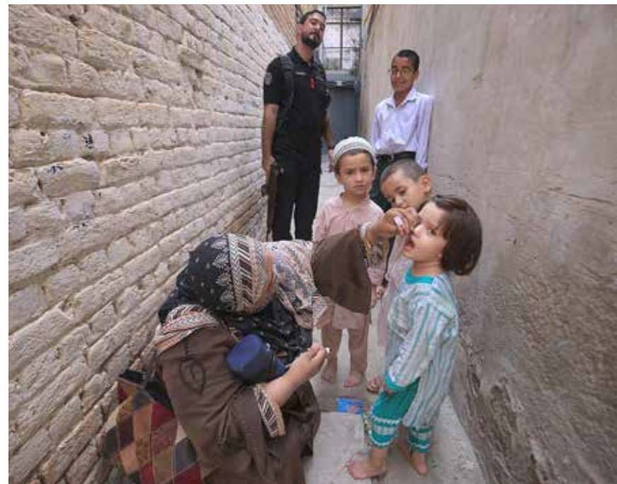
PESHAWAR: Female Polio worker administering polio drops to children at Warsak road during anti-polio vaccination campaign in the city.