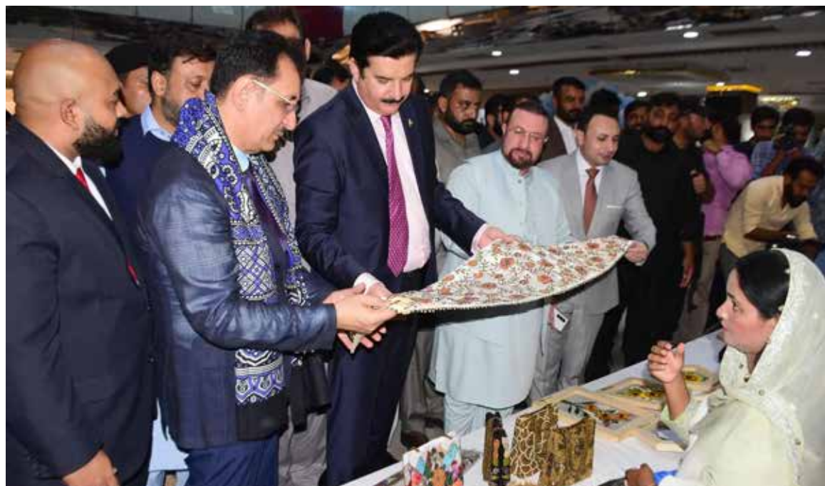
ISLAMABAD: Governor Khyber Pakhtunkhwa Faisal Karim Kundi visiting ARTISTANS AT WORK EXHIBITION in the Federal Capital.

lice resorted to baton charges and tear gas to disperse the crowd. Several protesters were arrested and transported to different police stations. In a televised address, Chaudhry condemned the violence, stating: "Islamabad police was deliberately attacked by people led by the KP chief minister." "Those responsible for this chaos, including the mastermind, will be arrested and jailed." Chaudhry emphasized that PTI supporters faced no obstruction from the police but attacked deliberately to mask their rally's failure. He further vowed that legal consequences would follow, suggesting Gandapur's political future could see him imprisoned.