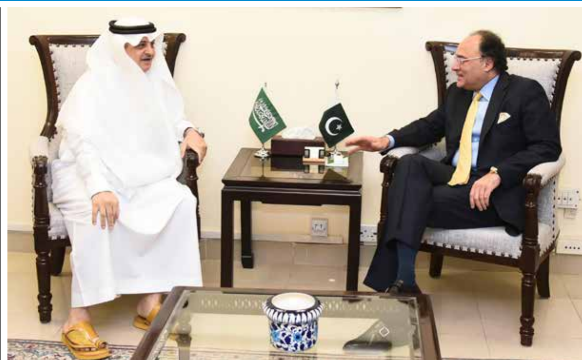
ISLAMABAD: Nawaf Bin Said Al-Malki, Ambassador of the Kingdom of Saudi Arabia, calls on Federal Minister for Finance and Revenue Senator Muhammad Aurangzeb.