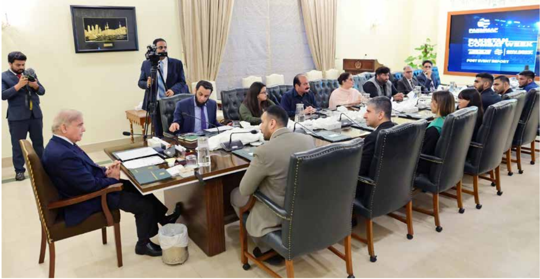
ISLAMABAD: A delegation of the Mixed Martial Arts Federation called on Prime Minister Muhammad Shehbaz Sharif.

FROM PAGE 01 the meeting virtually and will not travel to Islamabad. The ministerial meeting follows a series of preparatory meetings by the Commission of Senior Officials (CSO) of SCO Member States, which concluded in Islamabad on 10th and 11th September 2024. The ministers are set to focus their discussions on enhancing regional trade cooperation, advancing sustainable development, and improving connectivity among SCO nations to promote economic prosperity. The outcomes of this meeting will be reviewed during the Council of Heads of Government meeting, scheduled for 15-16 October 2024 in Islamabad, Pakistan, as the current Chair of the SCO Council of Heads of Government, is using its position to promote economic cooperation.