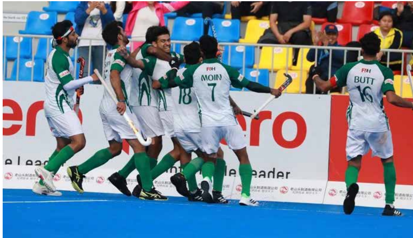
minute of the second quarter, restore Pakistan's lead which was enough to secure a win. Remember, Pakistan's first against Malaysia and South Korea, respectively.