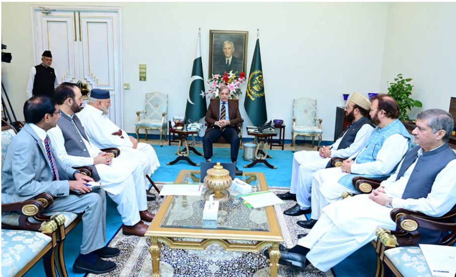
ISLAMABAD: A delegation of parliamentarians of PMLN from KP called on Prime Minister Muhammad Shehbaz Sharif.—DNA

WRIGHTWOOD A wildfire in the hills near Los Angeles exploded overnight, torching dozens of homes as its foot-print swelled 1,000 percent by Wednesday. The Bridge Fire is one of three out-of-control blazes that have erupted around the United States' second-biggest city, fueled by a punishing heat wave and fanned by gusting winds. Authorities issued widespread evacuation orders as the fire tore through the towns of Wrightwood and Mt Baldy, destroying at least 33 homes, several cabins, and racing through a ski resort. "We live in the canyon so that fire was coming right in there, and you couldn't take anything out of there," local resident Jenny Alaniz emotionally told broadcaster KTLA. I got the dogs out. Our house is gonna burn," she sobbed. An AFP journalist in Wrightwood witnessed the aftermath of the fire, where the charred shells of buildings and vehicles stood shrouded in smoke. The fire broke out early Sunday afternoon in Angeles National Forest north of Los Angeles, and by Tuesday had grown to around 4,000 acres (1,600 hectares).—APP