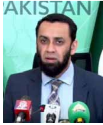
ed out the need to change societal mindsets that deprive women of their legal inheritance rights.

"It is unfortunate that women continue to be denied their rightful inheritance. To change this mindset, we must address the cultural barriers," Tarar said. "We must accept that women deserve their rightful inheritance. When this house raises its voice, the mindset will change." He highlighted recent reforms that allow the NADRA to issue succession certificates, simplifying the inheritance process with only four key documents: a Family Registration Certificate (FRC), a death certificate, a succession certificate, and an affidavit. He praised Pakistan's historic milestone of electing its first female Prime Minister when