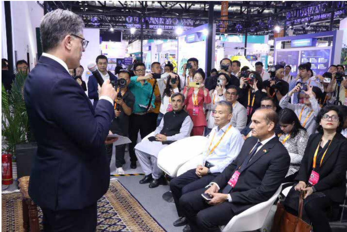
Conference: Together for a Shared Future during CIFTIS. The conference, along

pavilion features industrial park operators and development authorities, offering attendees direct access to valuable expertise on infrastructure and investment-ready environment in Pakistan. Welcoming the attendees, Ambassador Hashmi highlighted 13 priority sectors for investment in Pakistan, ranging from manufacturing and technology to energy, agriculture, and infrastructure development. He acknowledged the valuable contributions of Pakistani organizations participating in CIFTIS, including the Export Processing Zone Authority (EPZA), Green Pakistan Initiative, Dhabeji Economic Zone, Allama Iqbal SEZ, National Bank of Pakistan, and others, which are pivotal in fostering B2B relationships between Pakistan and China. The Ambassador stated that as part of Pakistan's efforts to further economic engagement with China, the Embassy will also host the Pakistan Investment