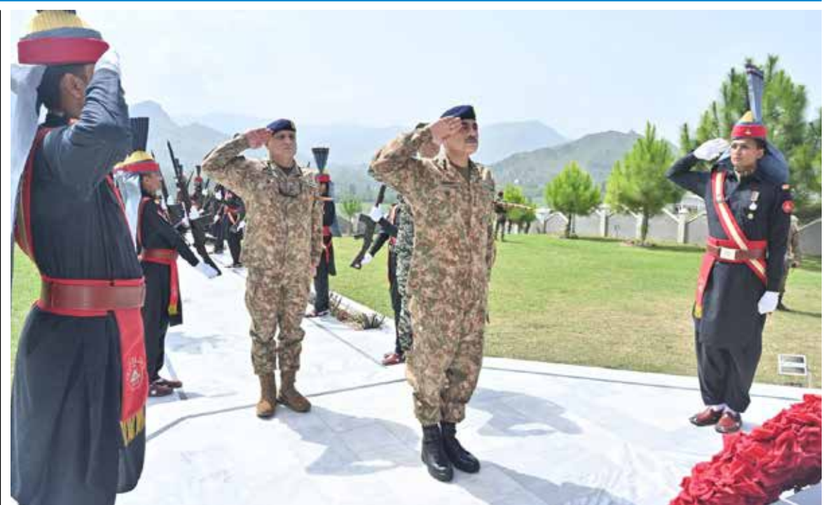
PESHAWAR: Army Chief General Syed Asim Munir lays the wreath at Yadgar-e-Shuhada and pays tribute to Shuhada.

ISLAMABAD: Jamiat Ulema-e-Islam (F) leader Maulana Fazlur Rahman ruled out any probability of imposing Governor's rule in the Khyber Pakhtunkhwa. Talking to the newsmen in the National Assembly JUI-F chief said that the law and order situation in the KP was not good. Can the governor control such a situation, he asked. He termed the KP CM's statement to have talks with Afghanistan as emotional that were far from reality. Responding to his stance on the constitutional amendment, he explained that his party would not back it. He said that his party members would support it if anything surfaces regarding the reforms in the parliament.