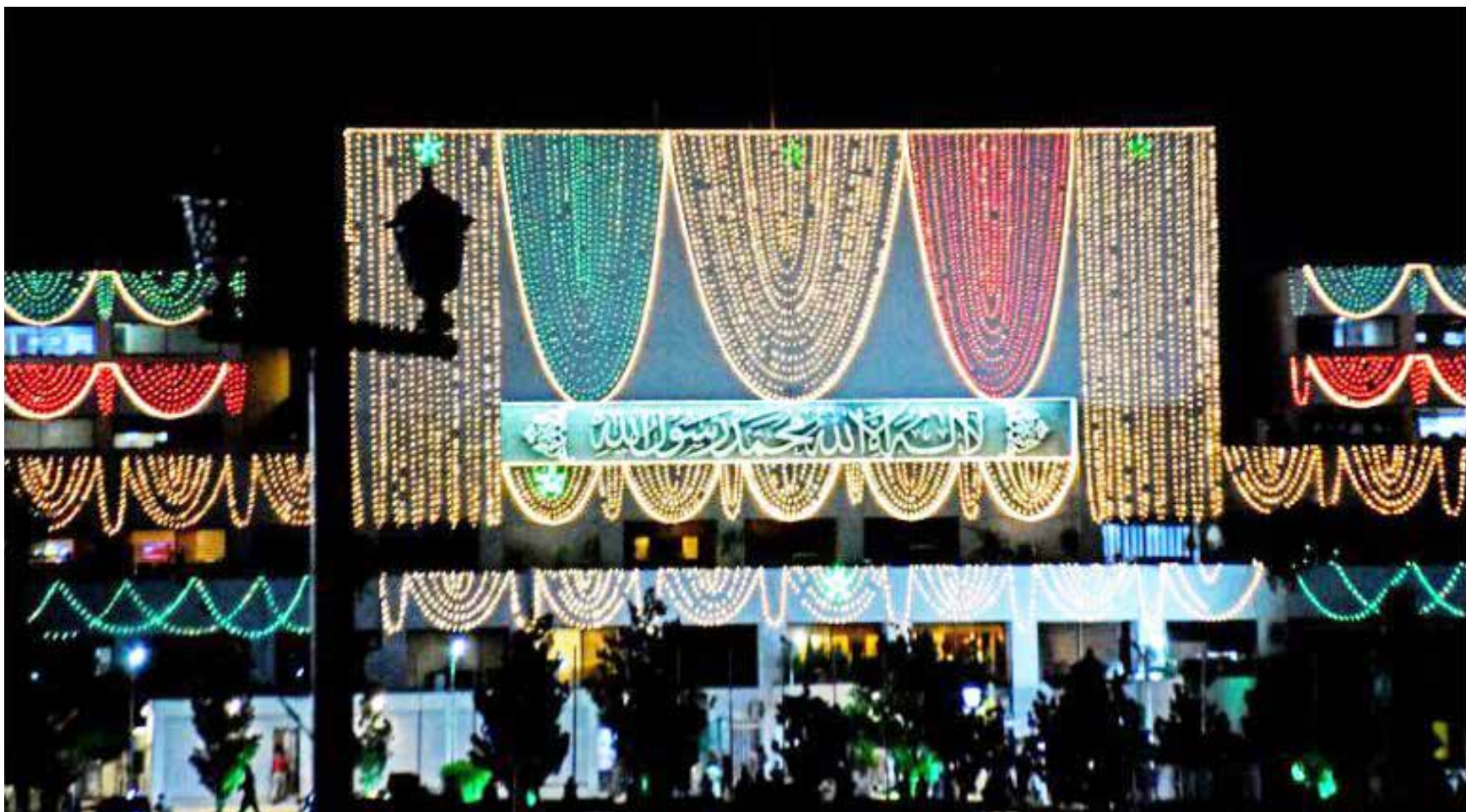
ISLAMABAD: A view of lightings in connection with Eid Milad un Nabi SAW, in the Federal Capital.