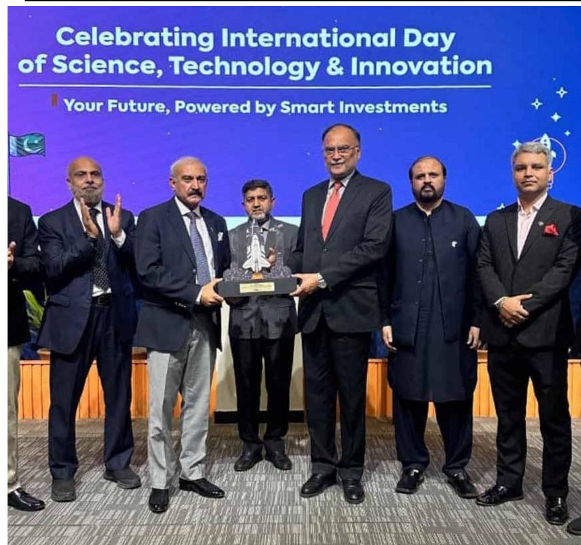
RAWALPINDI: Federal Minister for Planning Ahsan Iqbal getting a souvenir after inauguration of NICAT investment ecosystem.

ISLAMABAD: Gold prices in Pakistan continued their upward trend, reaching a new record high on Monday. In the local market, the price for a tola of gold surged by Rs1,700, hitting Rs268,000. This increase follows a previous record of Rs266,300 set on Saturday. The price of gold for 10 grams also saw a significant rise, climbing by Rs1,458 to reach Rs229,767, as reported by the All-Pakistan Gems and Jewellers Sarafa Association (APGJSA). Internationally, gold prices also increased, with the rate rising to $2,587 per ounce, including a $20 premium, reflecting a $10 gain for the day. Silver prices, however, remained unchanged at Rs2,950 per tola. The latest surge in gold prices aligns with the global market's upward movement, marking a continued increase in the value of precious metals.