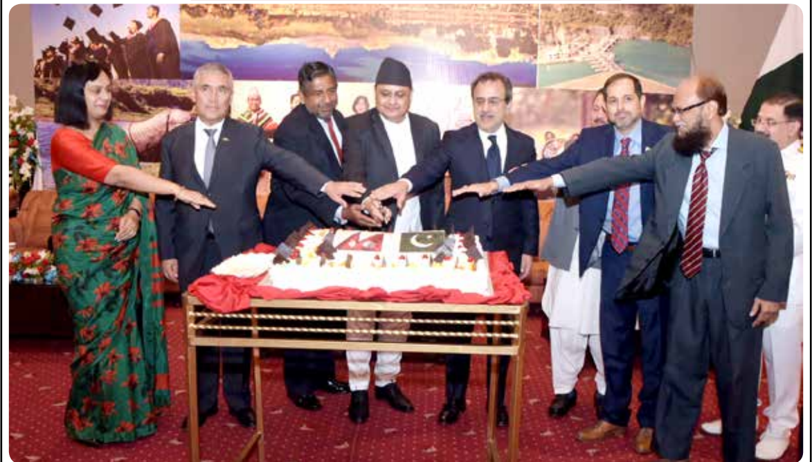
ISLAMABAD: Federal Minister for Power Awais Ahmed Khan Leghari, Ambassador of Nepal Tapas Adhikari, and others cutting the cake to celebrate the Constitution Day and the National Day of Nepal.