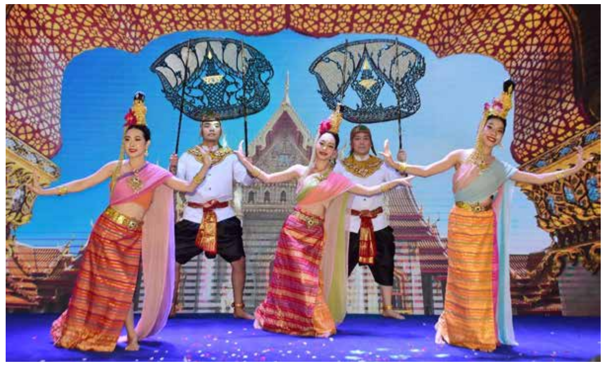
ISLAMABAD: Thai artists performing Thai traditional dance during a ceremony titled "Sawasdee Pakistan" organized by Thai Embassy at a local Mall, in the Federal Capital.