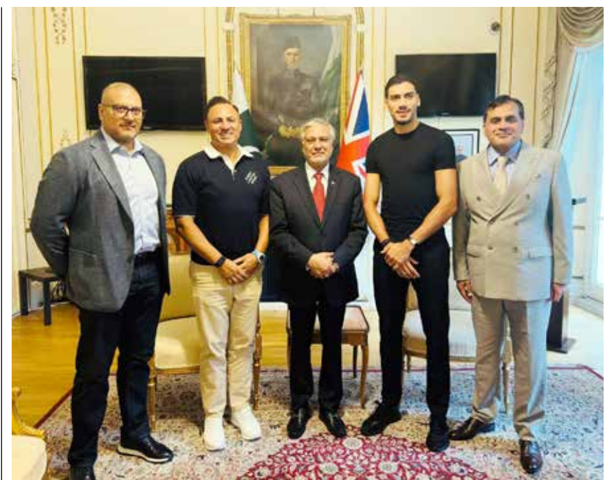
LONDON: Ishaq Dar, Deputy PM and Foreign Minister of Pakistan along with Pakistani HC greeting British-Pakistani boxer Hamzah Sheeraz on the Middleweight European Boxing title. (News on Page 6).