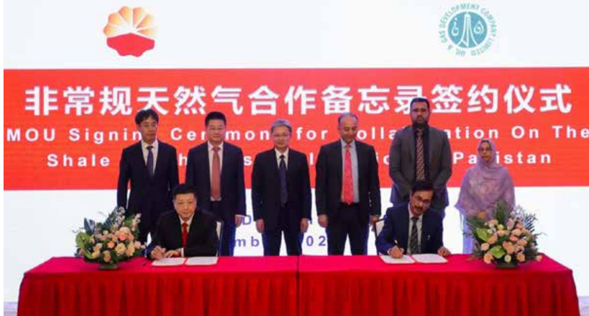
XIAN: Federal Minister for Petroleum Dr Musadik witnessed the MOU signing ceremony between OGDCL and Chinese company CCDC. - DNA

ISLAMABAD: The federal police once again sealed the Red Zone Islamabad and put security on high alert after the protest call by TLP. According to the report, four out of five red zone roads have been completely sealed by installing containers at Serena Chowk, Nadra Chowk, Express Chowk and Marriott Chowk. Police also sealed Fazal Haq Road and China Chowk by installing barbed wire on Jinnah Avenue and heavy personnel deployed in the area. Police said that the decision was being taken that a protest call was given by TLP as the campaign for the release of Dr Aafia Siddiqui.