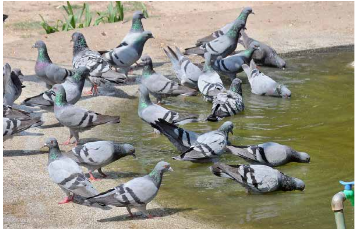
MULتان: Pigeons gather to drink water from a roadside pond.

facilitating easier access to necessary tools for cultivation. A joint working group has been formed to identify over 67 locations for the machinery selection and rental. Chief Minister Maryam Nawaz also directed officials to ensure wheat sowing on government land, reinforcing the commitment to bolster agricultural output in the province. The meeting reviewed recommendations for the "Transforming Punjab Agriculture" initiative, focusing on sustainable and efficient farming practices. Senior Provincial Minister Marriyum Aurangzeb, Information and Culture Minister Azma Zahid Bukhari, Agriculture Minister Ashiq Hussain Karmani, Chief Secretary Zahid Akhtar Zaman, Principal Secretary to CM Sajid Zafar Dall, Secretary of Agriculture, Secretary of Finance, Secretary of Energy, and other officials were also present.