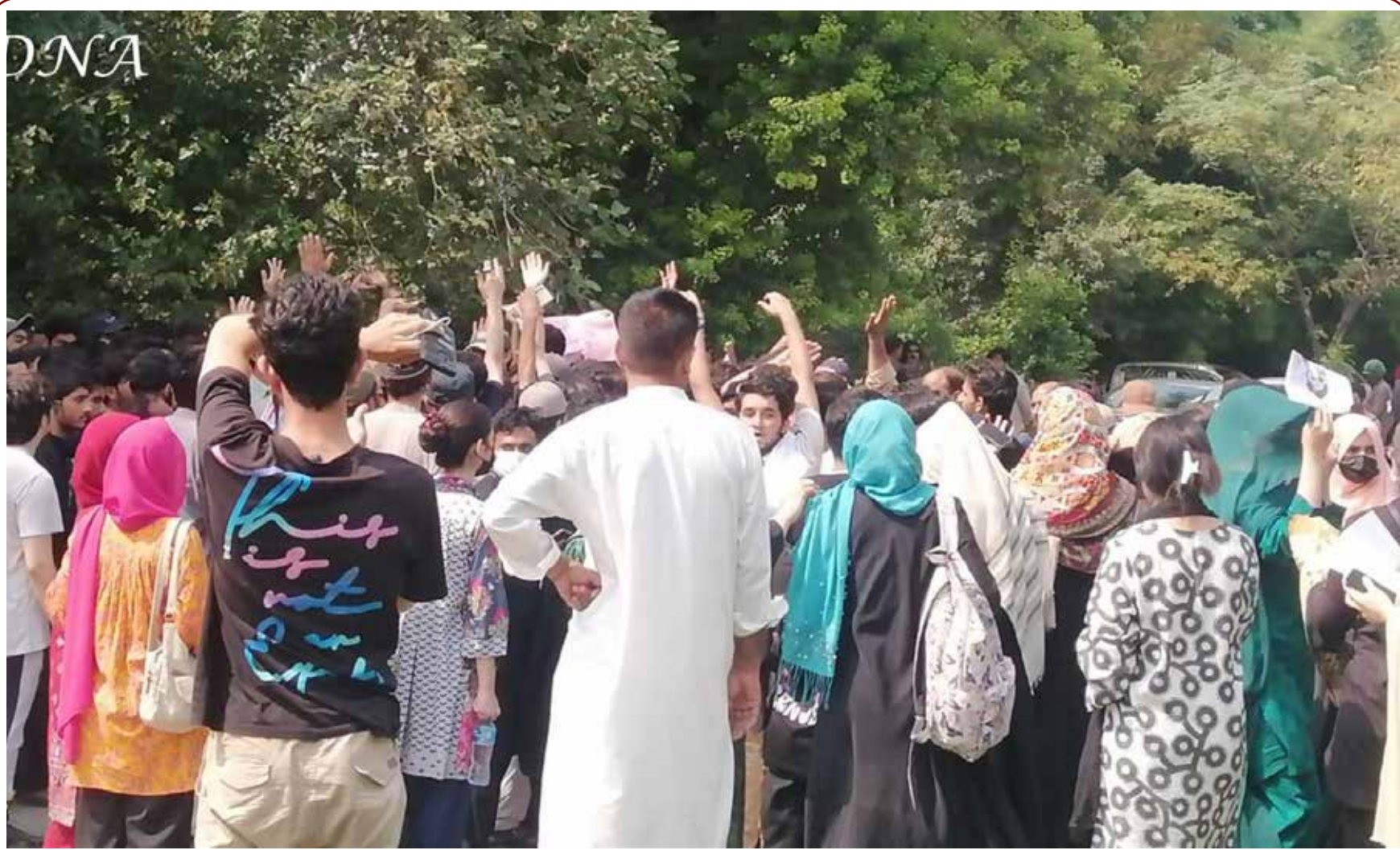
ISLAMABAD: Students and families are protesting against alleged irregularities in the examination process of PIMS Dental Medical College in G-8. They claim that the college administration promoted undeserving students, while those who met the criteria were overlooked. The protesters are urging higher authorities to investigate the matter, as they believe the future of hundreds of students is at risk.