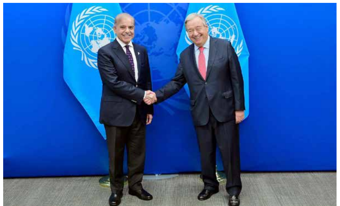
NEW YORK: Prime Minister Shehbaz Sharif meets with Secretary General of the United Nations Antonio Guterres on the sidelines of 79th session of United Nations General Assembly.