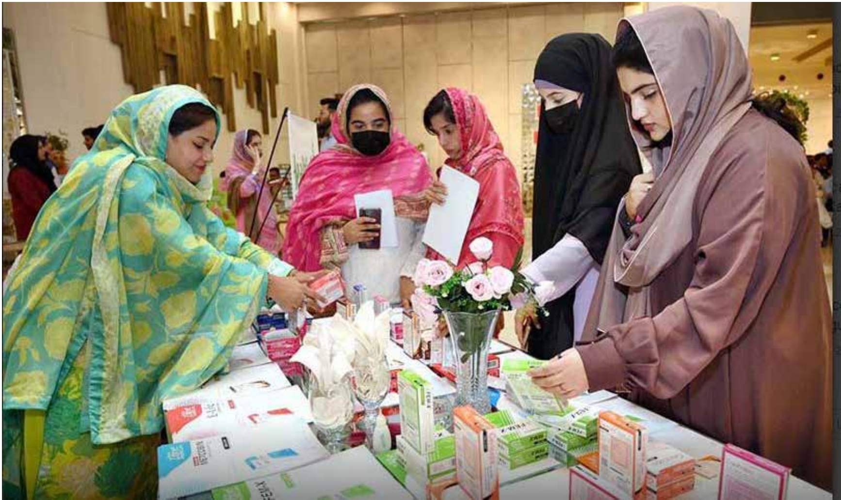
ISLAMABAD: Female visitors show interest in a pharmaceutical stall during World Pharmacists Day, organized by the Young Pharmacists Community Pakistan.

ISLAMABAD: Minister for Commerce Jam Kamal Khan, here on Wednesday, said that the Ministry of Commerce is reactivating 16 sectoral councils to prepare comprehensive plans and policies for industrial development and trade promotion in the country. Addressing the 7th Pharma Export Summit and Award 2024, the minister mentioned that the suggestions from the sectoral councils would be presented to the export development board, headed by the Prime Minister, for their swift implementation. He added that each sectoral council would have its own secretariat to determine ways and means and take measures to enhance trade and industrial activities in the country, noting that such initiatives would also help promote the local pharmaceutical sector. He emphasized that the pharmaceutical industry plays a pivotal role in the country's economic growth and development, and the government is fully committed to supporting the sector's development, adding that sufficient resources were available for economic progress and social prosperity in the country. The government is formulating comprehensive policies to address the issues faced by the local pharmaceutical sector. —APP