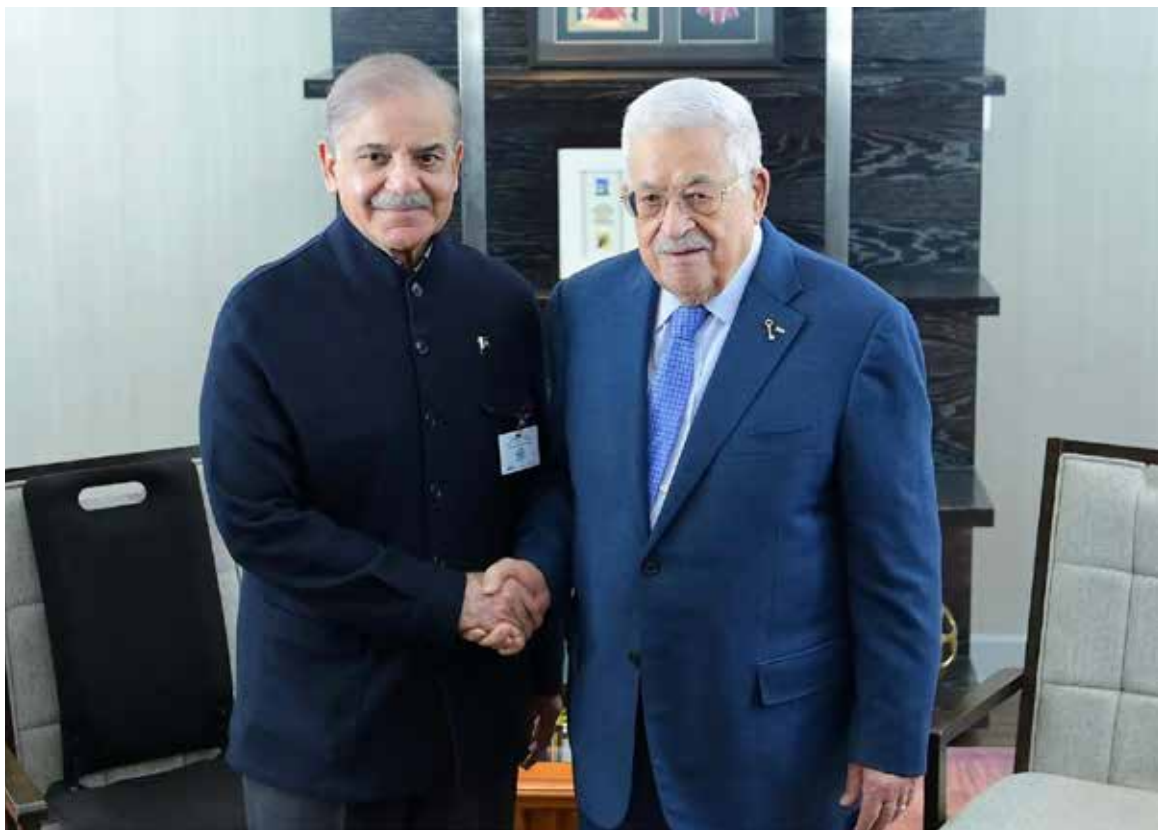
NEW YORK: Prime Minister Shehbaz Sharif meeting with the President of the State of Palestine Mahmoud Abbas on the sidelines of the 79th session of the United Nations General Assembly.