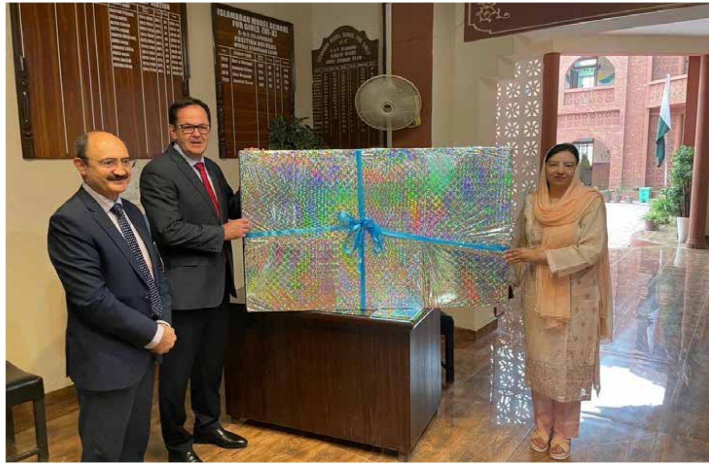
equipment, donated by Dr. Hussein Kavazović, Reis-ul-Ulema of the Islamic Community in