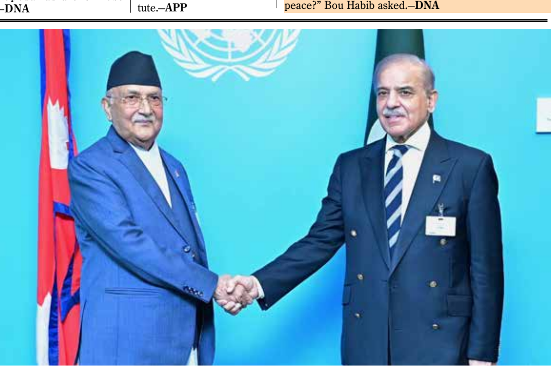
NEW YORK: Prime Minister Muhammad Shehbaz Sharif meets with the Prime Minister of Nepal H.E. K.P. Sharma Oli on the sidelines of 79th session of the United Nations General Assembly.