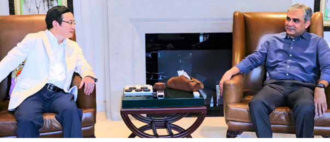
The interior minister meets Chinese Consul General Zhao Shiren