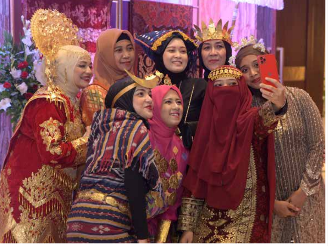
ISLAMABAD Ladies taking a selfie on the occasion of the Independence Day of Indonesia.