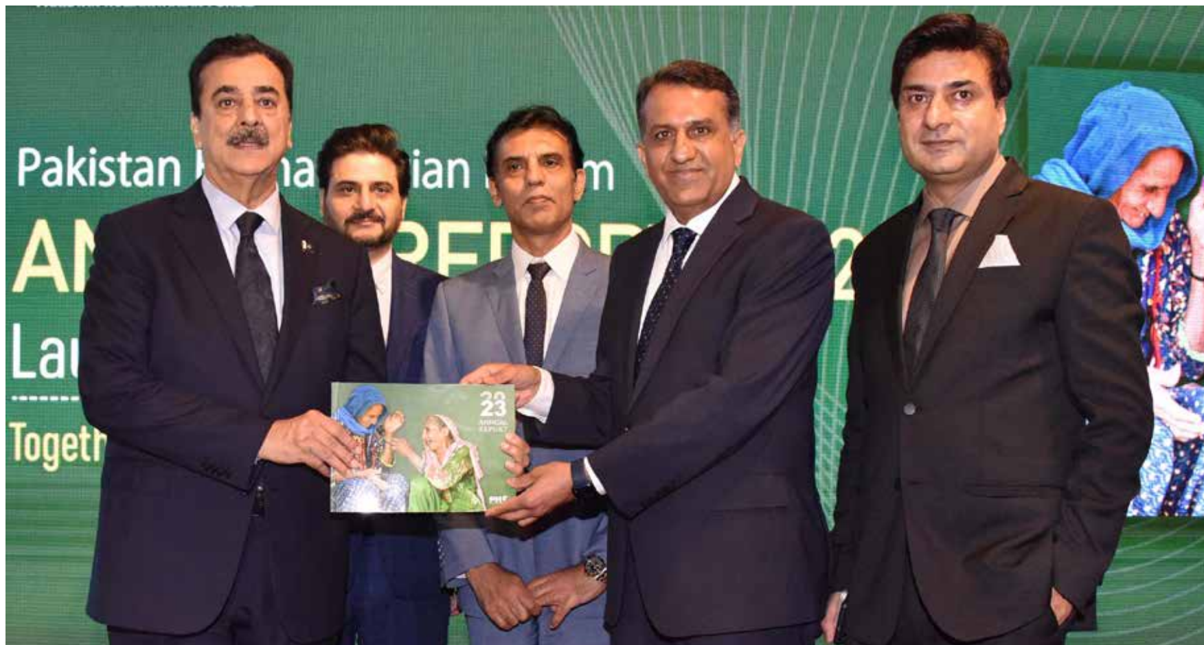
ISLAMABAD Chairman Senate, Syed Yousuf Raza Gilani is being presented the annual report of Pakistan Humanitarian Forum.