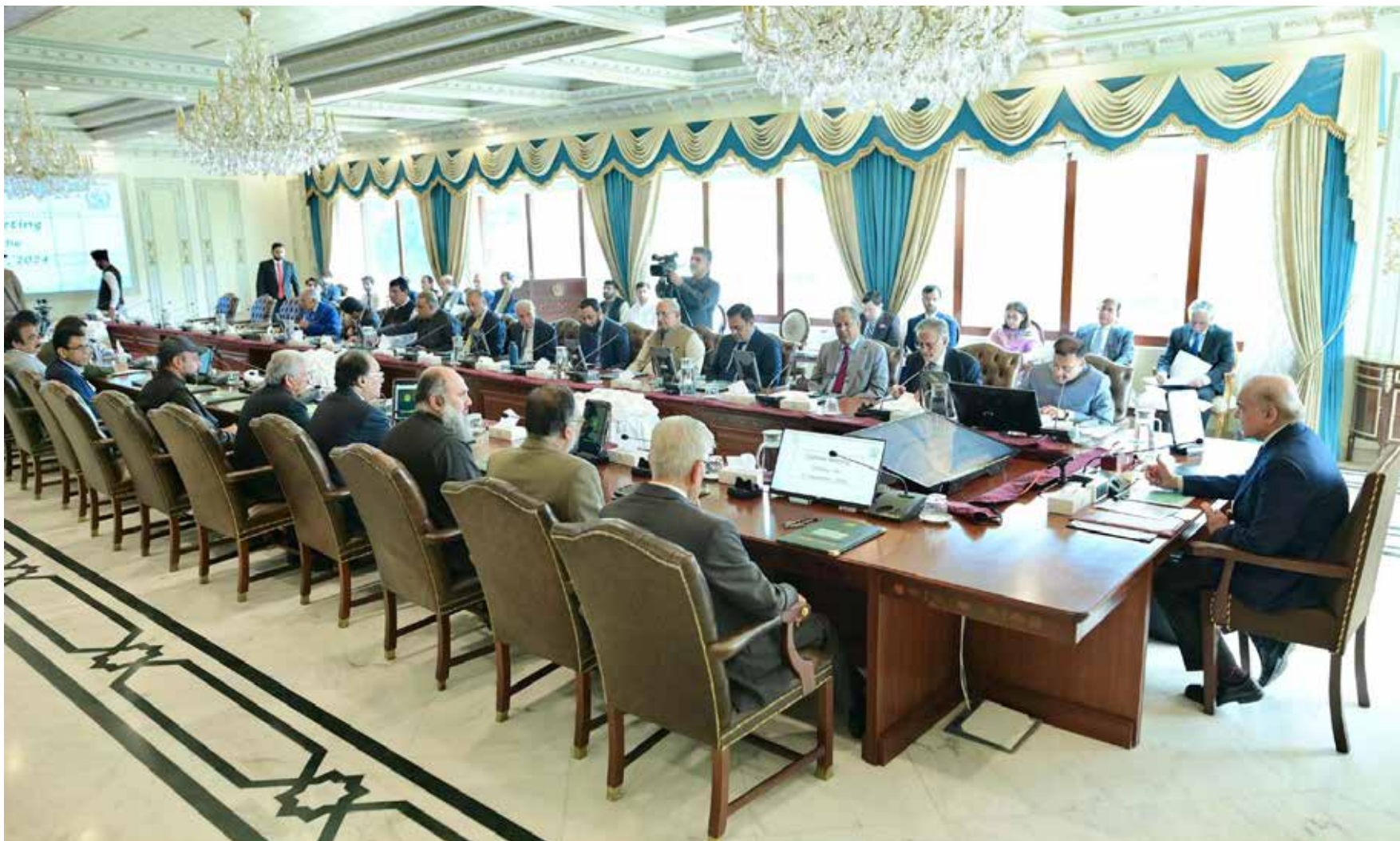
ISLAMABAD: Prime Minister Muhammad Shehbaz Sharif chairs a meeting of the Federal Cabinet. - (News on Page-01)