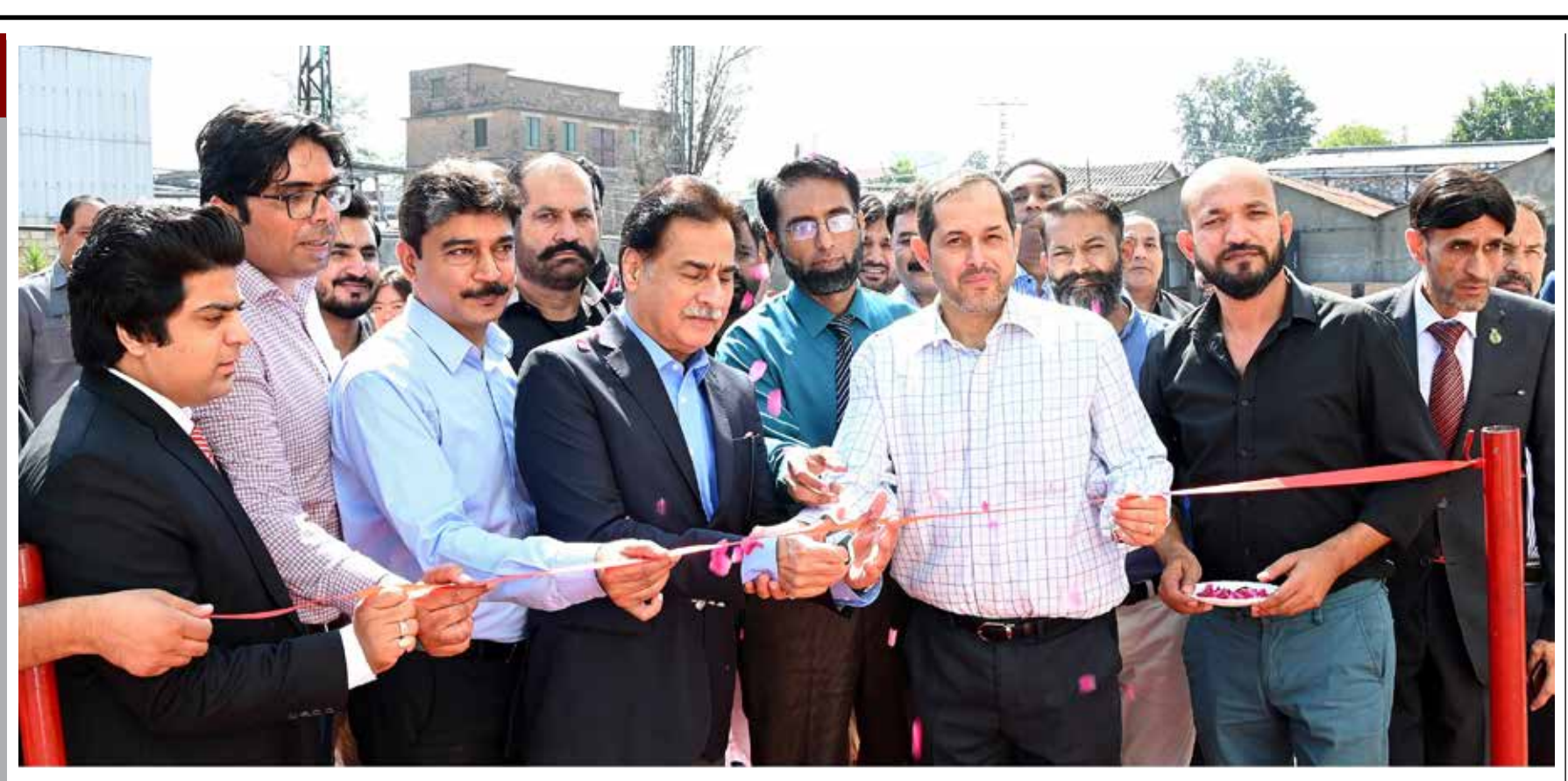
RAWALPINDI: Speaker National Assembly Sardar Ayaz Sadiq inaugurated Silo Grain storage facility. MNA Isphanyar M. Bhandara is also present on this occasion.—DNA