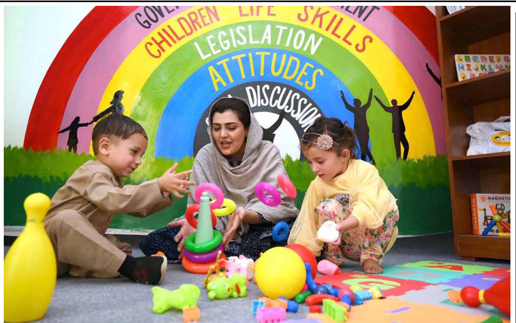
BAJUR: Children joyfully engage with colorful blocks alongside their teacher during the inauguration of the Child Protection Unit's counseling room at District Bajaur.

Building climate-resilience of the cities against adverse impacts of climate change is crucial for making the urban environmentally-sustainable and resilient-livable places, Alam highlighted.During the