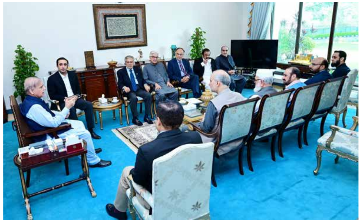
ISLAMABAD: Chairman Pakistan Peoples Party Bilawal Bhutto Zardari and a delegation of Jamaat-e-Islami led by Amir e Jamaat Hafiz Naeem ur Rehman called on PM Shehbaz Sharif.