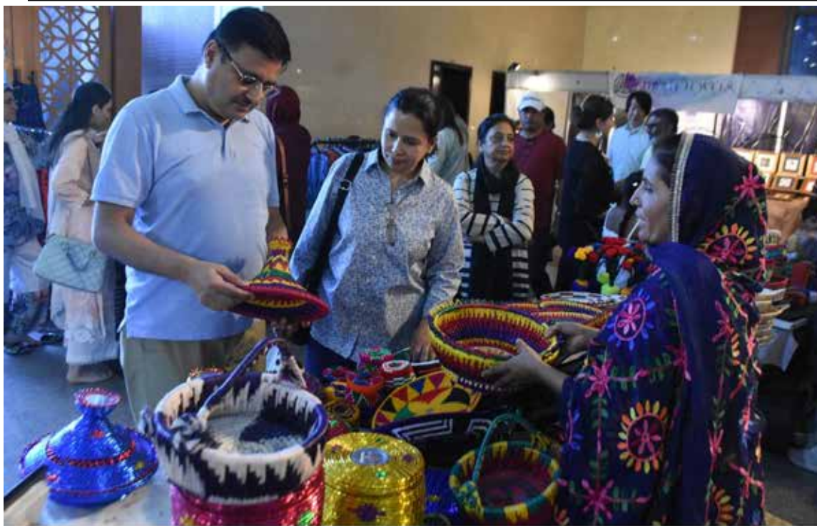
ISLAMABAD: Oct06-Ambassador of Nepal, Tapas Adhikari visiting DAACHI arts and crafts exhibitions at Pak China Friendship Center in the Federal Capital.

KYIV: One person has died after Russian forces attacked Ukraine overnight with 87 Shahed drones and four different types of missiles, officials said Sunday. A 49-year-old man was killed in the Kharkiv region after his car was hit by a drone, said regional Gov. Oleh Syniubov. A gas pipeline was also damaged and a warehouse set alight in the city of Odesa, Ukrainian officials reported. Ukraine's air force said in a statement that air defenses had destroyed 56 of the 87 drones and two missiles over 14 Ukrainian regions, including the capital, Kyiv. Another 25 drones disappeared from radar "presumably as a result of anti-aircraft missile defense," it said. The barrage comes a day after Ukrainian President Volodymyr Zelenskyy said Saturday that he will present his "victory plan" at the Oct. 12 meeting of the Ramstein group of nations that supplies arms to Ukraine. Zelenskyy presented his plan to U.S. President Joe Biden in Washington last week.—DNA