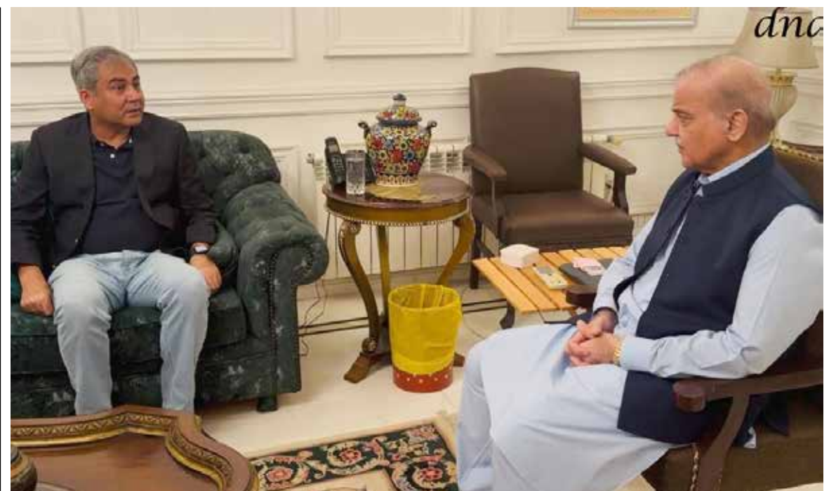
LAHORE: Federal Minister for Interior Syed Mohsin Raza Naqvi calls on Prime Minister Muhammad Shehbaz Sharif. - DNA