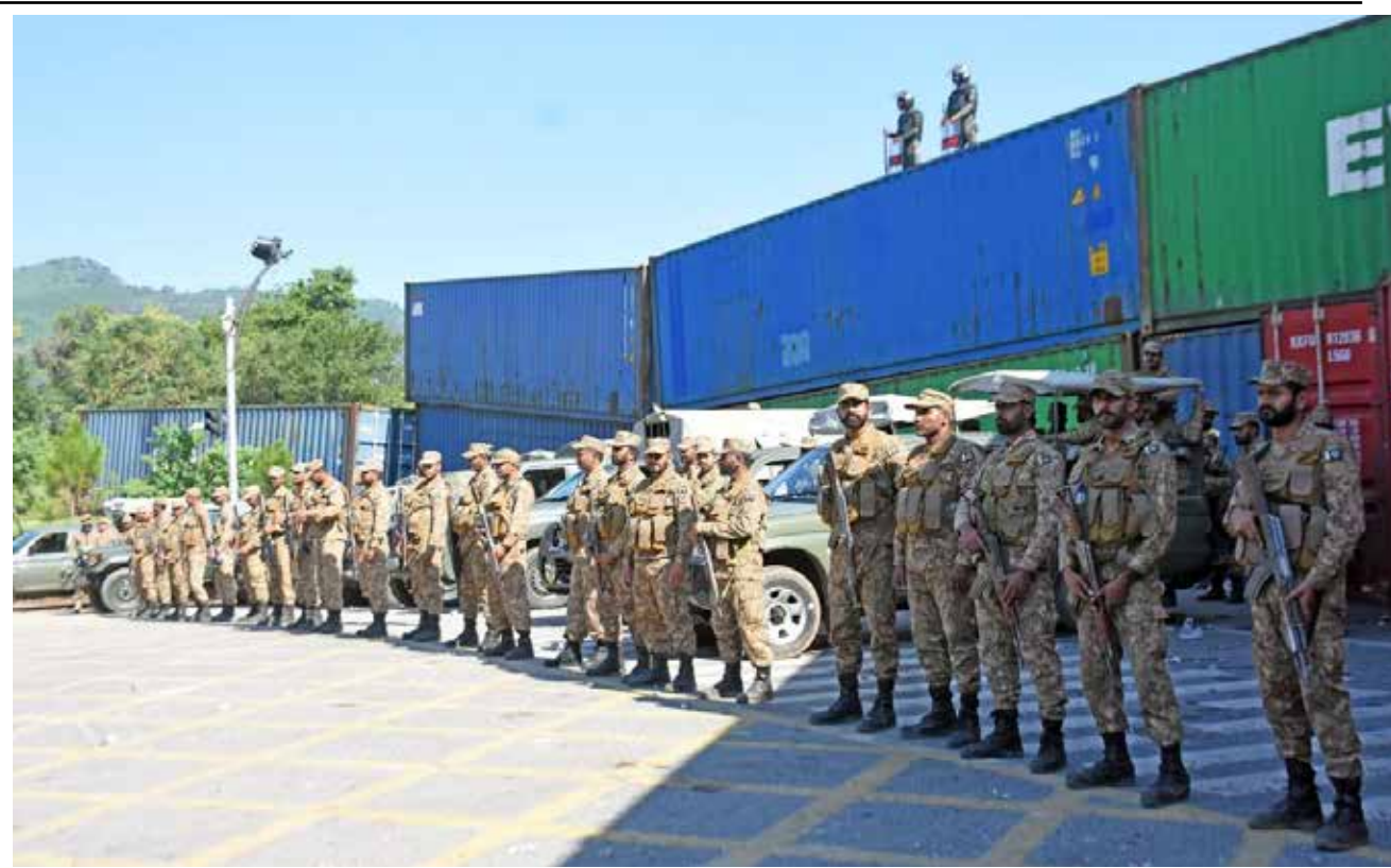
ISLAMABAD: The troops of Pakistan Army and Frontier Constabulary (FC) have completely taken the control of D Chowk on Sunday.

TEHRAN: Leader of the Islamic Revolution Ayatollah Seyyed Ali Khamenei has conferred the Order of Fat'h (Conquest) on Brigadier General Amir-Ali Hajizadeh, the commander of the IRGC's Aerospace Division. The order is granted to warriors with dramatic victories. The awarding on Sunday came after Iran's launch of 180 ballistic missiles at Israeli military and intelligence bases in the Tel Aviv area on Tuesday. "The awarding of the order is in recognition of the brilliant Operation True Promise," Iran's news agencies reported. The medal consists of the likeness of three palm leaves on top of the grand mosque of Khorramshahr in southwest Iran as a symbol of resistance, the flag of Iran and the word fat'h. Operation True Promise refers to Iran's retaliatory strikes on Israel on April 13 and October 1. In April, Iran launched hundreds of drones and missiles against Israel, in an unprecedented attack that came as a response to the occupying regime's raid on the Iranian consulate in Syria.