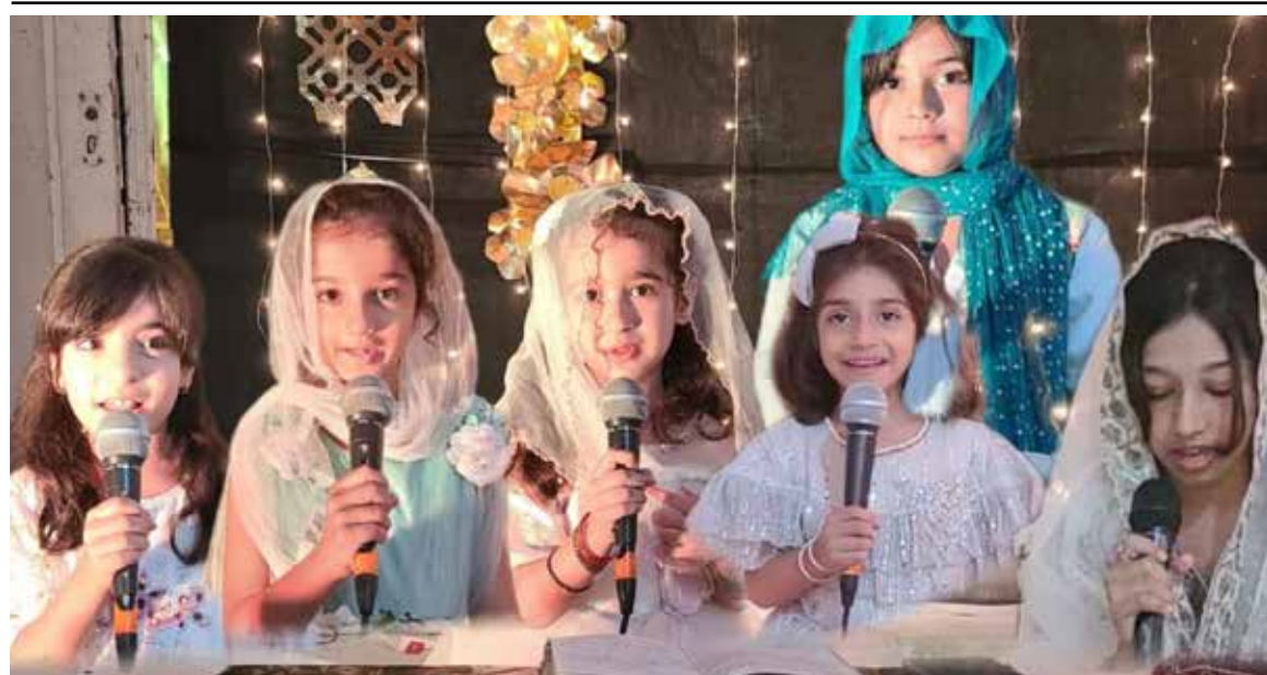
ISLAMABAD: Students taking part in a Milad un Nabi program held at A. L. I School System, Sector G 10. The audience appreciated the skills of the young students and exhorted them to continue their activities even in the coming days.