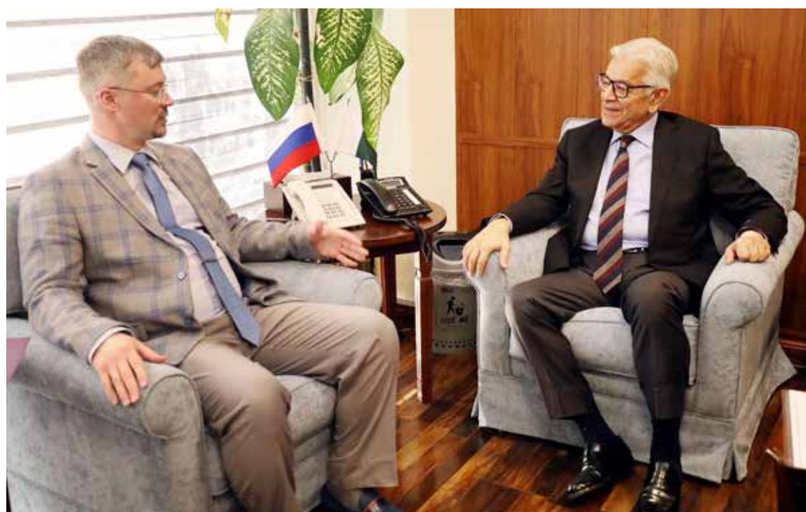
ISLAMABAD: Ambassador of the Russian Federation Albert P Khorev calls on Defence Minister Khawaja Asif. Both sides discussed matters of mutual interest.

and research. He also directed the organization to organize events during Space Week. Ahsan Iqbal emphasized the need to escape economic slavery and achieve self-sufficiency. He also highlighted how scientific advancements could better combat natural disasters. He praised the government's significant improvement in educational standards within six months and also congratulated students on their successful space project exhibitions.—APP