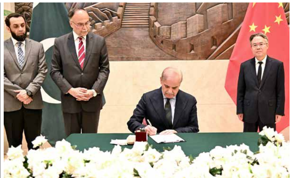
ISLAMABAD: Prime Minister Muhammad Shehbaz Sharif records his remarks at the Embassy of the People's Republic of China.