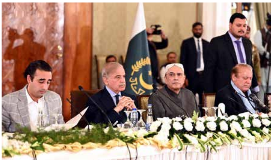
ISLAMABAD: President Asif Ali Zardari and Prime Minister Shehbaz Sharif along with other national leaders hosting All Parties Conference on Gaza.

LAHORE: Punjab's Information Minister, Azma Bukhari, has criticised the Pakistan Tehreek-e-Insaf (PTI) party, suggesting that its leaders are attempting to replicate the chaos that led to the formation of Bangladesh. Speaking at a press conference, she expressed concerns over recent PTI protests in Islamabad, stating that the party's activities are designed to incite unrest and confusion. Bukhari claimed that the PTI has been using resources from Khyber Pakhtunkhwa to fuel its agenda against the federal government. She pointed out that during a recent protest, 120 Afghan nationals were apprehended, and one police constable lost his life, questioning the rationale behind such violence. "The PTI leadership wanted to create a scenario akin to that of Khalida Zia's era but failed miserably," the Punjab Information Minister stated, referencing the historical context of political turmoil. Bukhari emphasised that children and innocent people were manipulated into participating in protests, only to realise they were being used for violent objectives.