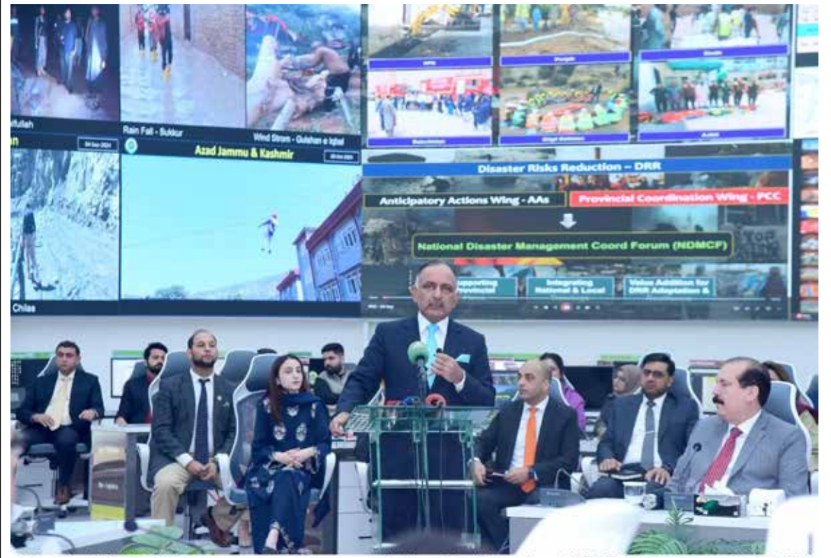
ISLAMABAD: NDMA held ceremony to commemorate National Resilience Day at NEOC, NDMA HQs.

This year's National Resilience Day brought together government officials, experts, and key stakeholders, generating meaningful discussions on climate finance, gender equality, and national resilience. The event reinforced Pakistan's dedication to building a more sustainable and resilient future, honoring the memory of disaster victims while focusing on forward-looking strategies to protect the nation.