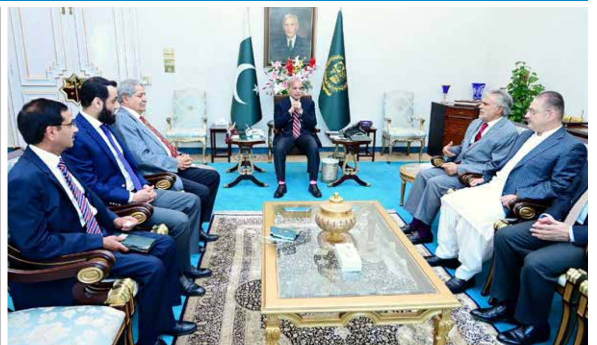
ISLAMABAD: A delegation of Pakistan Peoples Party calls on Prime Minister Shehbaz Sharif.