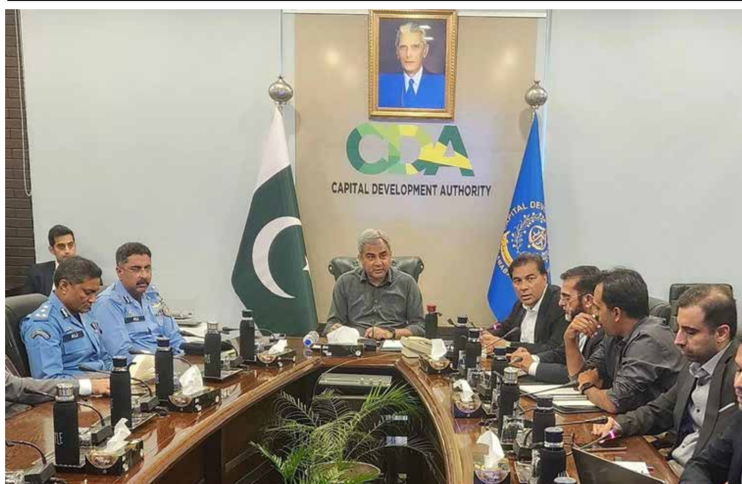
ISLAMABAD Federal Minister for Interior Mohsin Naqvi chairing a meeting regarding preparations of SCO Summit at CDA Headquarters.

ISLAMABAD: Senior Kashmiri leader and wife of Chairman Jammu and Kashmir Liberation Front Yasin Malik, Mushaal Hussein Mullick, on Tuesday said that the haunting scenes of destruction caused by the October 8, 2005 earthquake are still vivid in her memory, even after 19 years. In her message on the 19th anniversary of the catastrophic earthquake, she reflected on the immense devastation that unfolded that day, private news channel reported. "It's been 19 years since the tragic earthquake, yet the horrifying images of entire towns and villages being wiped off the map in mere moments are still fresh in my mind. It is heartbreaking to remember how entire communities were erased in a matter of seconds," she expressed. —APP