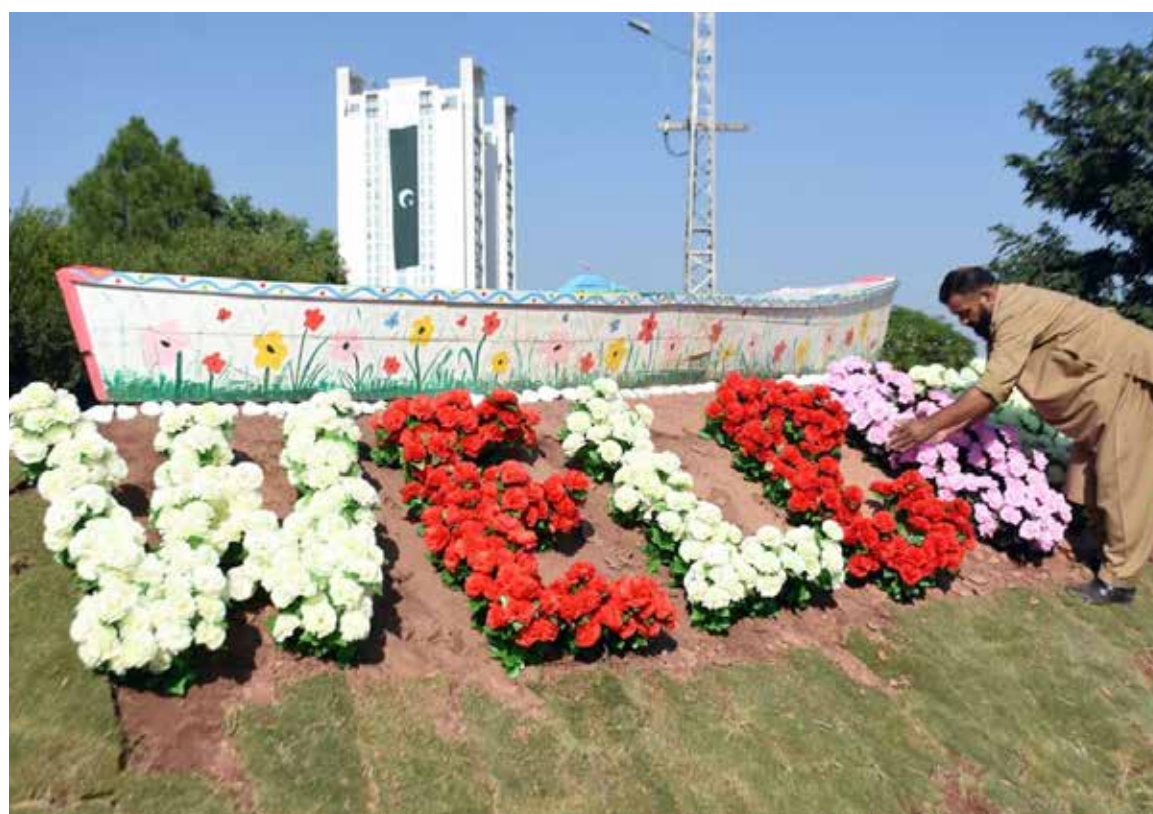
ISLAMABAD: Oct13-A view of Rawal Dam Chowk Flyover decorated in connection with SCO Summit in the Federal Capital. —ONLINE

ISLAMABAD: Indus River System Authority (IRSA) on Sunday released 119,600 cusecs water from various rim stations with inflow of 85,400 cusecs. According to the data released by IRSA, water level in River Indus at Tarbela Dam was 1536.05 feet and was 138.05 feet higher than its dead level of 1,398 feet. Water inflow and outflow in the dam was recorded as 44,200 cusecs and 52,000 cusecs respectively. The water level in River Jhelum at Mangla Dam was 1204.20 feet, which was 154.20 feet higher than its dead level of 1,050 feet. The inflow and outflow of water was recorded 8,600 cusecs and 35,000 cusecs respectively. —APP