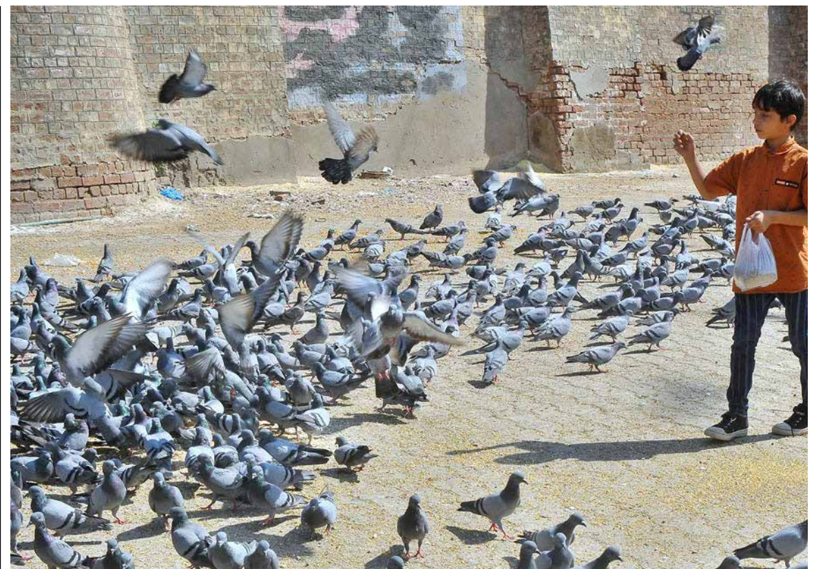
MULTAN: A child throwing food for the flock of pigeons at a roadside.

lani noted the significant role played by the Belt & Road Initiative and the China-Pakistan Economic Corridor (CPEC) in reshaping Pakistan's energy and infrastructure sectors. He added that with CPEC entering its second phase, bilateral cooperation would further expand into areas such as agricultural modernization, industrial growth, mining and mineral exploration, science and information technology, and educational and cultural partnerships, thereby transforming Pakistan's socioeconomic landscape. Gilani also highlighted the importance of the Global Development Initiative, launched by President Xi Jinping in the post-COVID world, describing it as a timely move that institutionalizes cooperation required for achieving the Sustainable Development Goals (SDGs). "It is a matter of satisfaction that China shares Pakistan's aspirations in achieving the SDGs," the Chairman said. He emphasized the need to enhance people-to-people connectivity and cultural linkages to realize the shared goal of an integrated, peaceful, and cooperative region. He expressed his gratitude to Mr. Wang Huihua, Chairman of the China Chamber of Commerce in Pakistan, and his team for organizing the event.