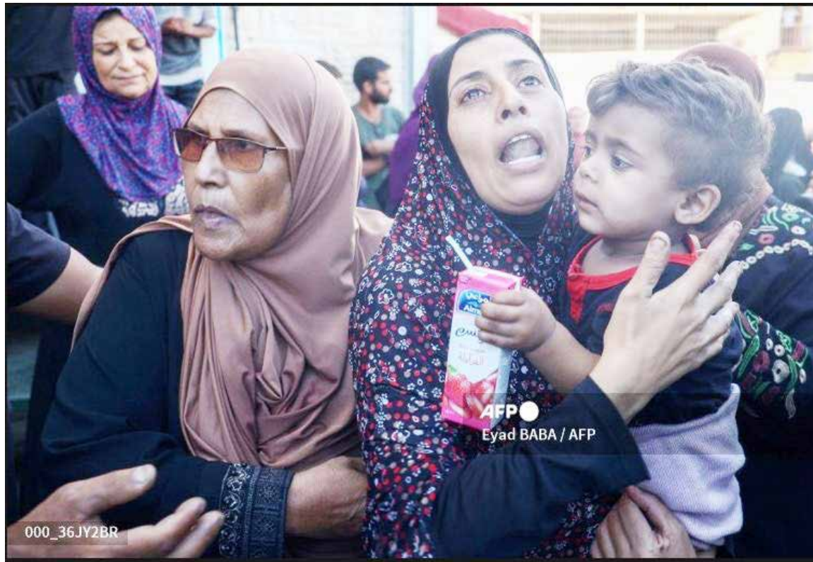
GAZA : A Palestinian woman mourning relatives, killed in an Israeli strike on Al-Bureij refugee camp, during their funeral at the Al-Aqsa Martyrs hospital in Deir al-Balah in the central Gaza Strip on Sunday, amid the ongoing war between Israel and Hamas.