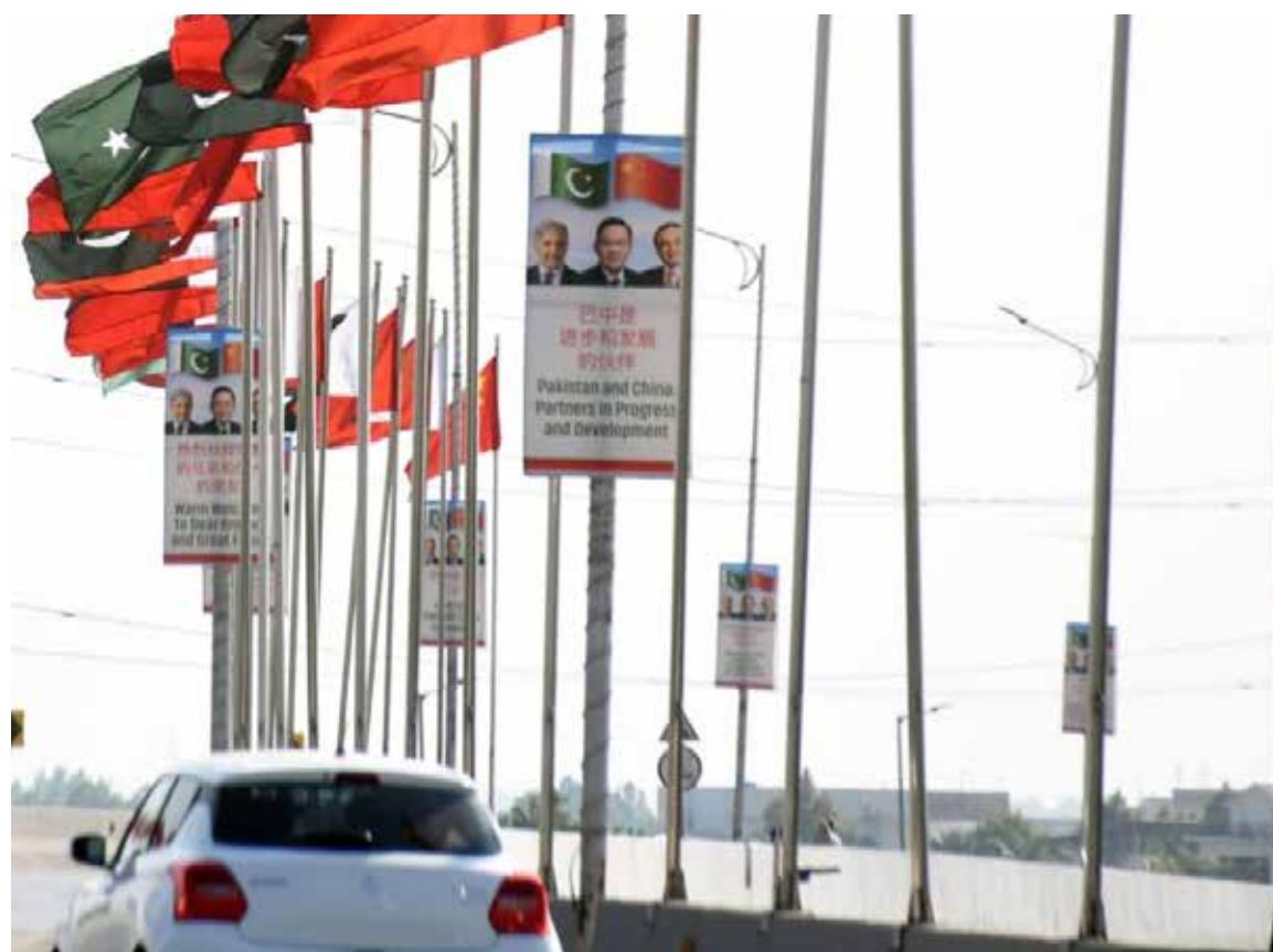
ISLAMABAD: A view of Rawal Dam Chowk Flyover decorated in connection with SCO Summit in the Federal Capital. — Online

BAGHDAD: Iran's top diplomat vowed Sunday there would be "no red lines" for the country in defending its people and interests, ahead of Israel's expected retaliation for Iran's recent missile attack. "While we have made tremendous efforts in recent days to contain an all-out war in our region, I say it clearly that we have no red lines in defending our people and interests," Foreign Minister Abbas Araghchi wrote in a post on X. Iran fired 200 missiles at Israel on October 1 in what it said was retaliation for the killing of Tehran-aligned militant leaders in the region and a general in Iran's Revolutionary Guards. Israeli Defense Minister Yoav Gallant has vowed Israel's response will be "deadly, precise, and surprising." — Agencies