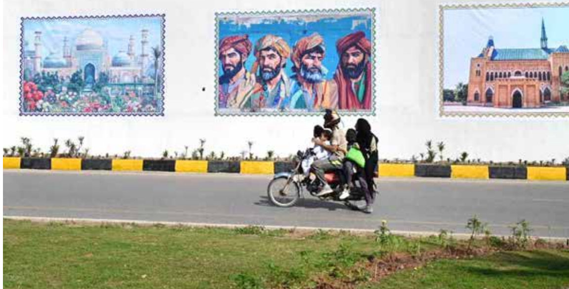
ISLAMABAD: WBeautiful paintings adorn the walls, enhanc.