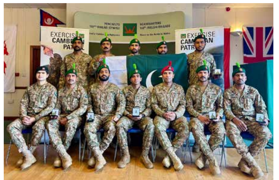
LONDON: Pakistan Army's Team participated in Exercise Cambrian Patrol - 2024, which was held at Wales, UK from 04-13 October 2024. Pakistan team won gold medal.

RAWALPINDI: Pakistan Army's Team participated in Exercise Cambrian Patrol - 2024, which was held at Wales, UK from 04-13 October 2024. This year, Exercise Cambrian Patrol celebrated its 65th year. The exercise has retained its demanding professional standards; patrols all across from the globe had to move tactically across inhospitable terrain, covering a distance of 60 kms within 48 hours, completing specialist tasks in a contested environment. This year, 128 teams from 42 Countries participated in the Exercise and out of all these teams, Pakistan Army's Team showed Exceptional Performance in the exercise and has been awarded with the Gold Medal. It is indeed a proud moment for the whole Nation and Pakistan Army, which is known for its professionalism and highest standards of training. Pakistan Army has always held Country's flag high, Alhamdulillah.