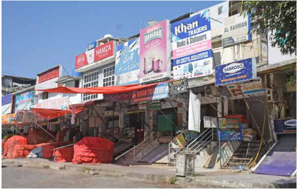
ISLAMABAD:-Daily life suspended due to the SCO summit held in the Federal Capital.

ed for special focus on the prevention of excesses with workers of brickkilns. The chief minister said that the provision of justice and protection to the rights of such oppressed class of the society is the responsibility of the government and directed the concerned authorities to register brickkilns and compile data of lthe abourers working in them. WThe chief minister also directed the authorities of the Labour Department to prepare a line of action to protect all rights of the brickkiln workers and ensure the provision of incentives announced by the government for them. He has also directed the speedy completion of the digitization process for better management of the Employees Social Security Institute (ESSI).-APP