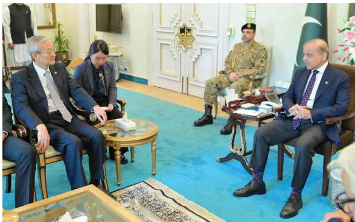
ISLAMABAD: Secretary General Shanghai Cooperation Organisation Zhang Ming calls on Prime Minister Muhammad Shehbaz Sharif.