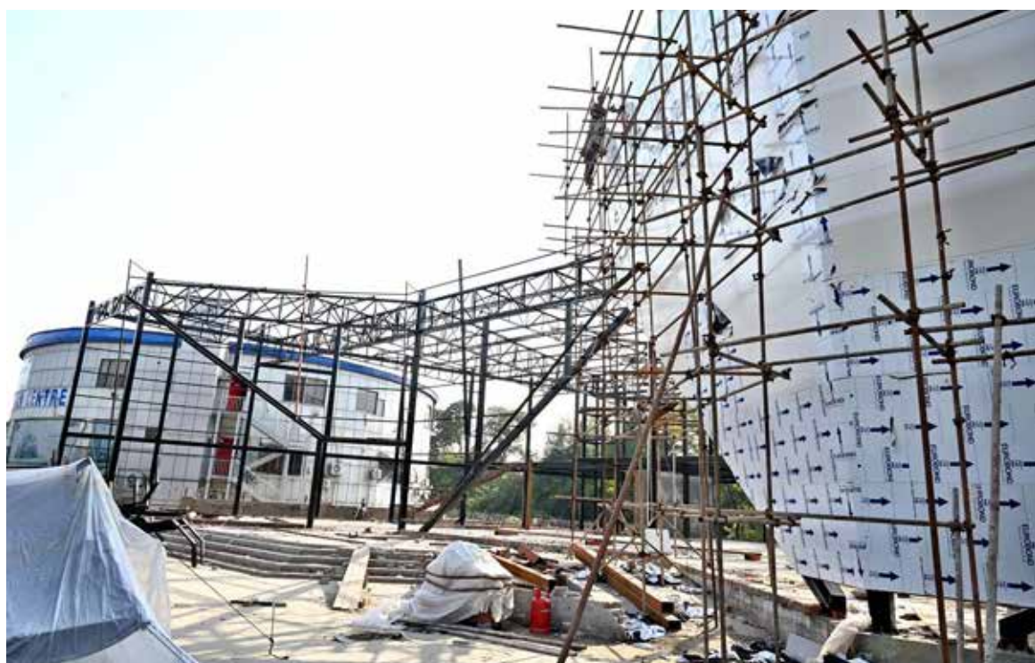
ISLAMABAD: Labourers busy in construction work of CDA Business Facilitation Centre at G-7 sector.