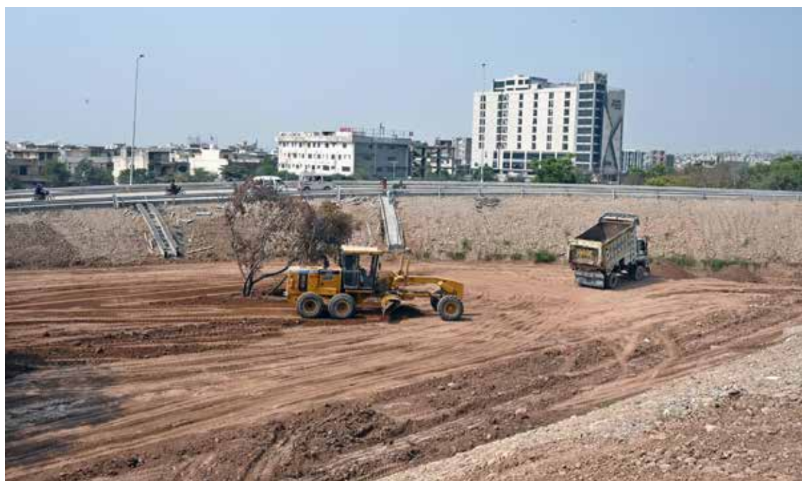
ISLAMABAD: Machinery is being used for leveling the ground to prepare a green area along the road near Kakpul.