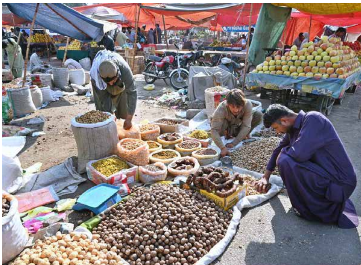
ISLAMABAD: Vendors selling and displaying dry fruits to attract the customers at their roadside setup along IJP Road.

of stored water from the reservoir for agriculture and contributed 590,361 million units of low-cost and environment friendly hydel electricity to the National Grid. Economic and financial benefits of one MAF of water in Pakistan are estimated at US$ 1,000 million (US$ 1 billion). Therefore, total benefits accrued from Tarbela Dam during the last 50 years stand at more than four hundred billion dollars.