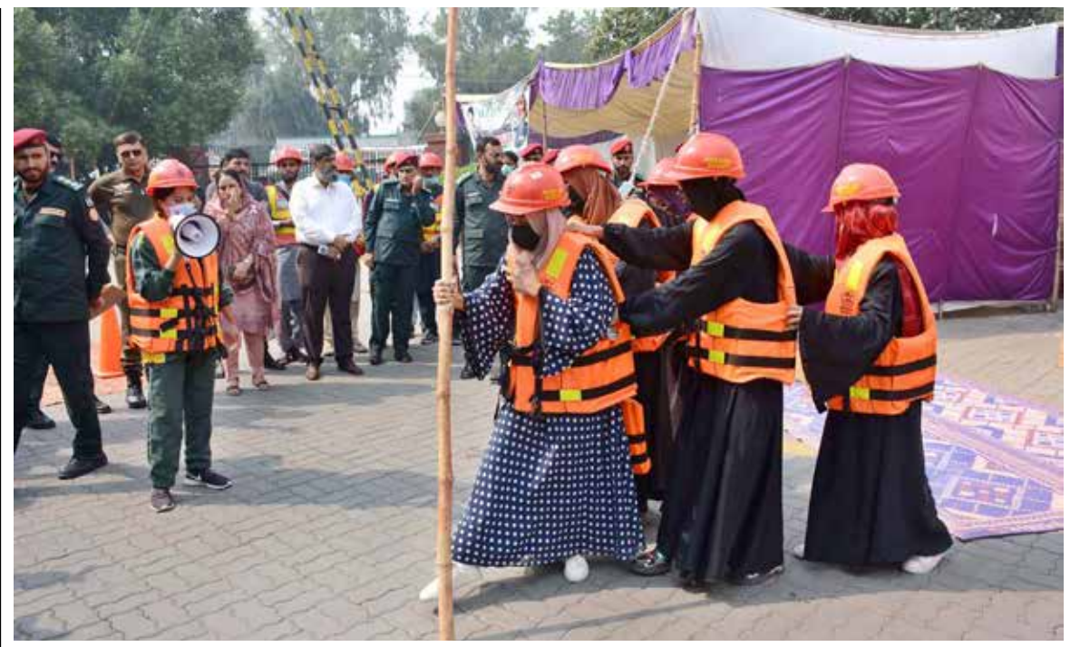
ISLAMABAD: Rescue 1122 Faisalabad CERT (Community Emergency Response Team) performing rescue skills during the annual CERT Challenge competitions at Central Rescue Station GTS Chowk.

agency revealed that the governor addressed the vice chancellors (VCs) of all public sector universities in the province and noted it with grave concern that despite instructions the certain universities had still assigned the charge of administrative posts to faculty members in violation of section 17-A of KP universities act 2012. He sought a detailed report of the administrative positions, name of incumbent and his post in the university and duration of his occupation of the administrative post. The governor further directed legal action under section 12(7) against all the VCs violating the legal provision of the act. It is pertinent to mention here that following the directives of the governor, the Agriculture University, Peshawar and Islamia College University Peshawar have repaired all the teaching faculty members to their respective departments.