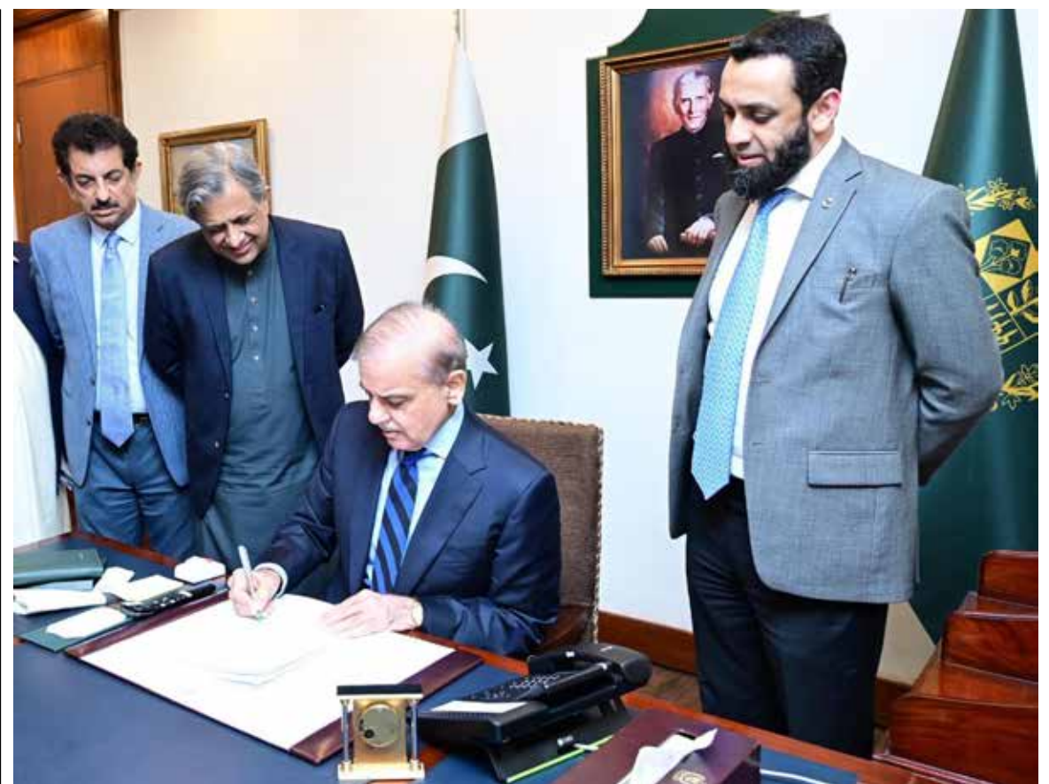
ISLAMABAD: Prime Minister Muhammad Shehbaz Sharif signs the advice for presidential assent on the 26th Constitutional Amendment Bill.