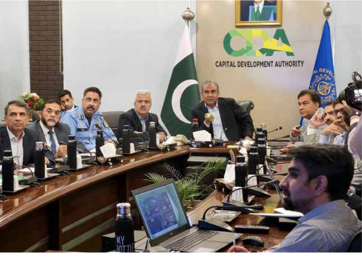
ISLAMABAD: Federal Minister for Interior Mohsin Naqvi chairing a meeting in CDA Headquarters Islamabad.