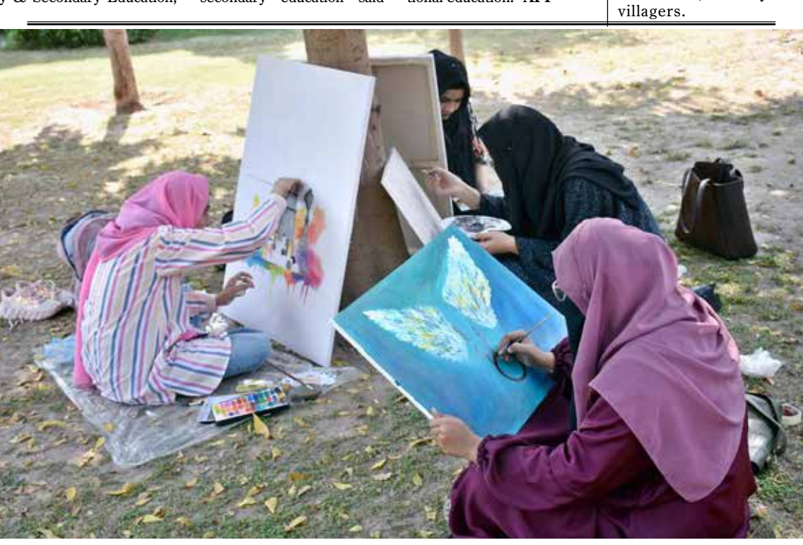
LAHORE: Students participating in Art Work Competition on Monday.