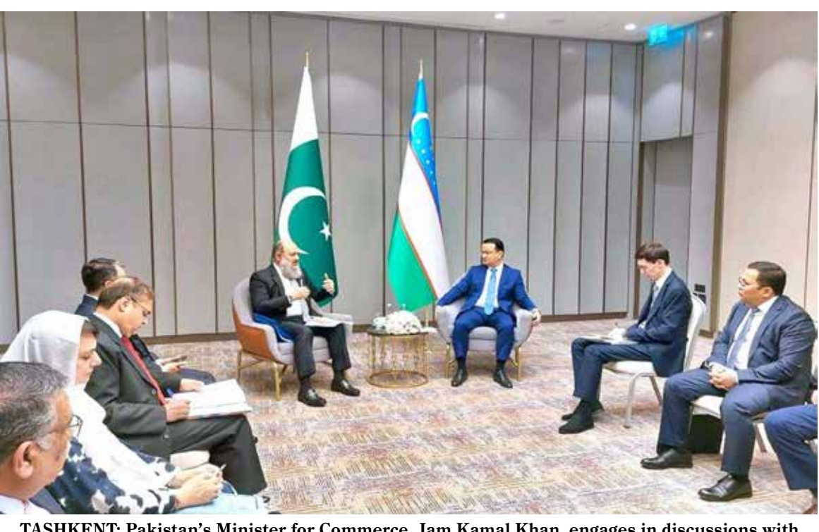
TASHKENT: Pakistan's Minister for Commerce, Jam Kamal Khan, engages in discussions with Uzbekistan's Minister of Investment, Industry and Trade, Laziz Kudratov.