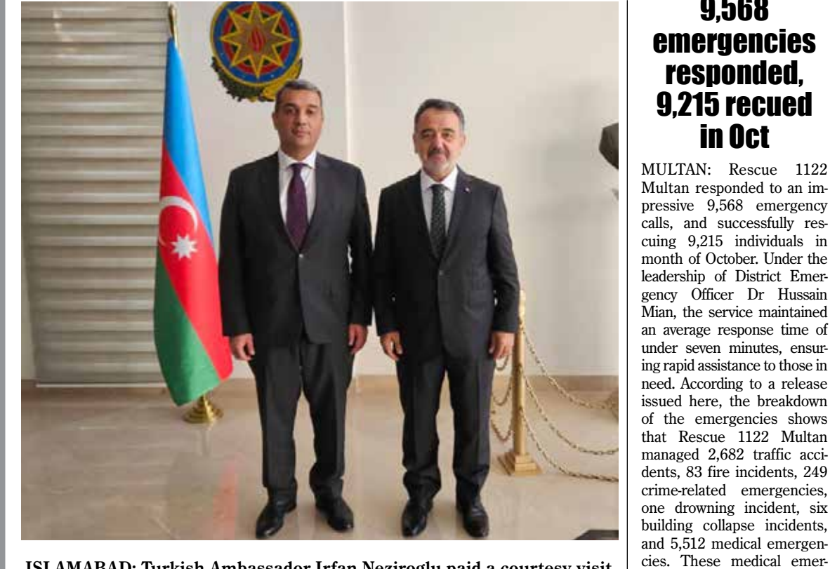
ISLAMABAD: Turkish Ambassador Irfan Neziroglu paid a courtesy visit to Khazar Farhadov, Ambassador of Azerbaijan to Pakistan.

A total of 589,546,678 shares were traded during the day as compared to 465,865,841 shares the previous trading day, whereas the price of shares stood at Rs 29.959 billion against Rs. 23.089 billion on the last trading day. As many as 445 companies transacted their shares in the stock market, 258 of them recorded gains and 140 sustained losses, whereas the share price of 47 companies remained unchanged. The three top trading companies were Power Cement with 56,698,604 shares at Rs 7.12 per share, K-Electric Limited with 38.931.623 shares at Rs 4.85 per share and Maple Leaf with 36,957,197 shares at Rs41.53 per share. Indus Motor Company Limited witnessed a maximum increase of Rs.70.50 per share price, closing at Rs 1,989.28, whereas the runner-up was Rafhan Maize Products Company Limited with Rs 63.75 rise in its per share price to Rs 7,505.35.— APP