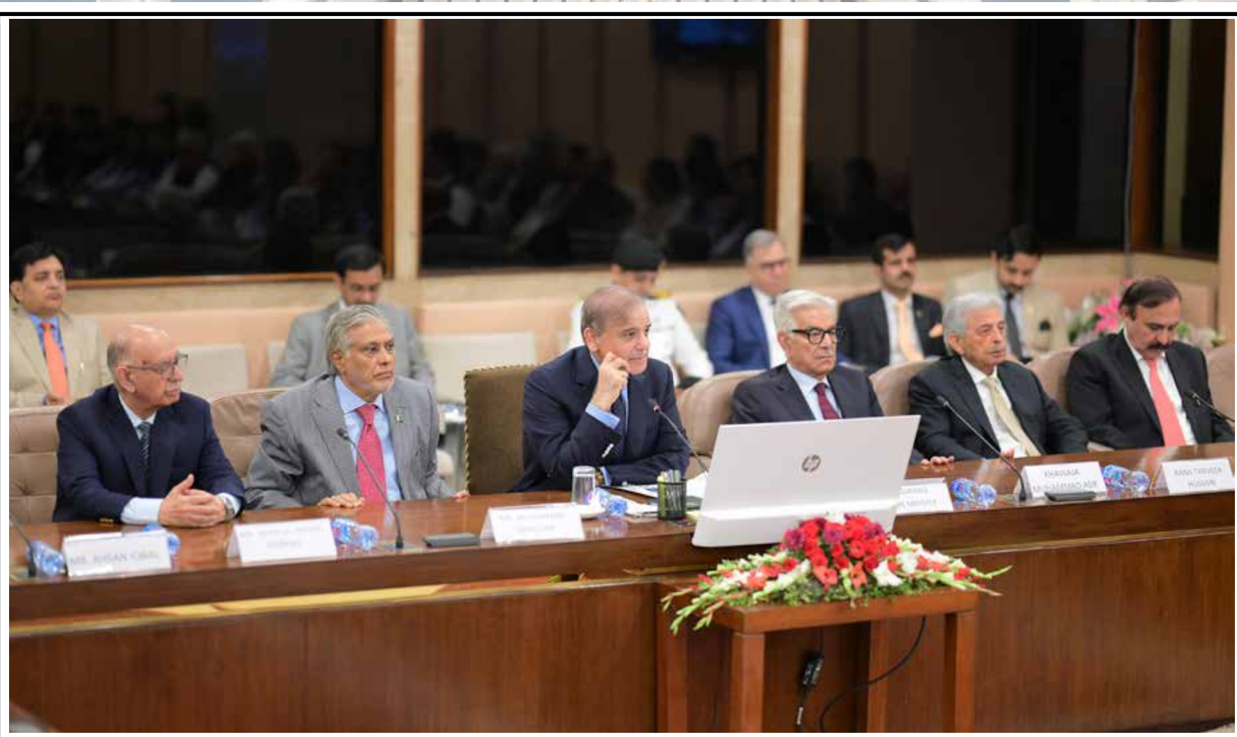
ISLAMAABD: Prime Minister Muhammad Shehbaz Sharif chairs a meeting of the PMLN's Parliamentary Party at Parliament House.