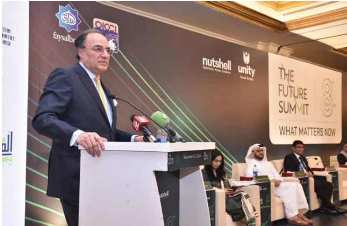
KARACHI: Federal Minister for Finance and Revenue Senator Muhammad Aurangzeb addresses the 8th Edition of The Future Summit in Karachi, discussing Pakistan's economic prospects and future financial strategies.

cy in the region. Turkiye was the third-biggest investor in Kyrgyzstan in the first half of 2024, behind Russia and China. But it lags in terms of trade, accounting for 3.8 percent of Kyrgyzstan's imports and exports, against 34.2 percent for China and 19.5 percent for Russia.—Agencies