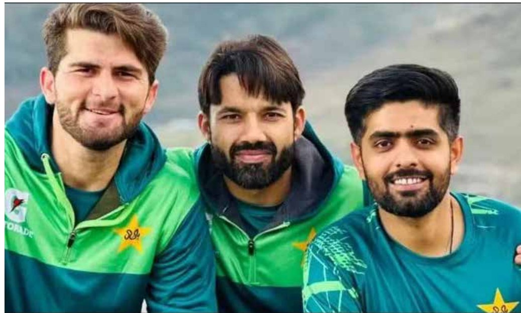
ing figures of 2/43 in his 10 overs, earned him 655 rating points. However, despite leading Pakistan's strong show in the aforementioned fixture with three wickets, Haris Rauf suffered a decline, dropping

DUBAI: Pakistan's star trio of Babar Azam, Mohammad Rizwan and Shaheen Shah Afridi experienced significant strides in the latest update of the International Cricket Council (ICC) ODI and Test Rankings. As per the latest ODI Batting Rankings, ace Pakistan batter Babar extended his stay at the summit with 822 rating points, while opening batter Imam-ul-Haq suffered a slight dip, slipping from 11th to 12th with 666 rating points. Meanwhile, Fakhar Zaman maintained his position in the Top 10, sitting at ninth spot with 675 rating points. On the other hand, Shaheen Shah Afridi jumped three places to secure fourth position in the ODI Bowling Rankings. His brilliant outing with the ball in the first ODI against Australia, where he returned brilliant bowl-