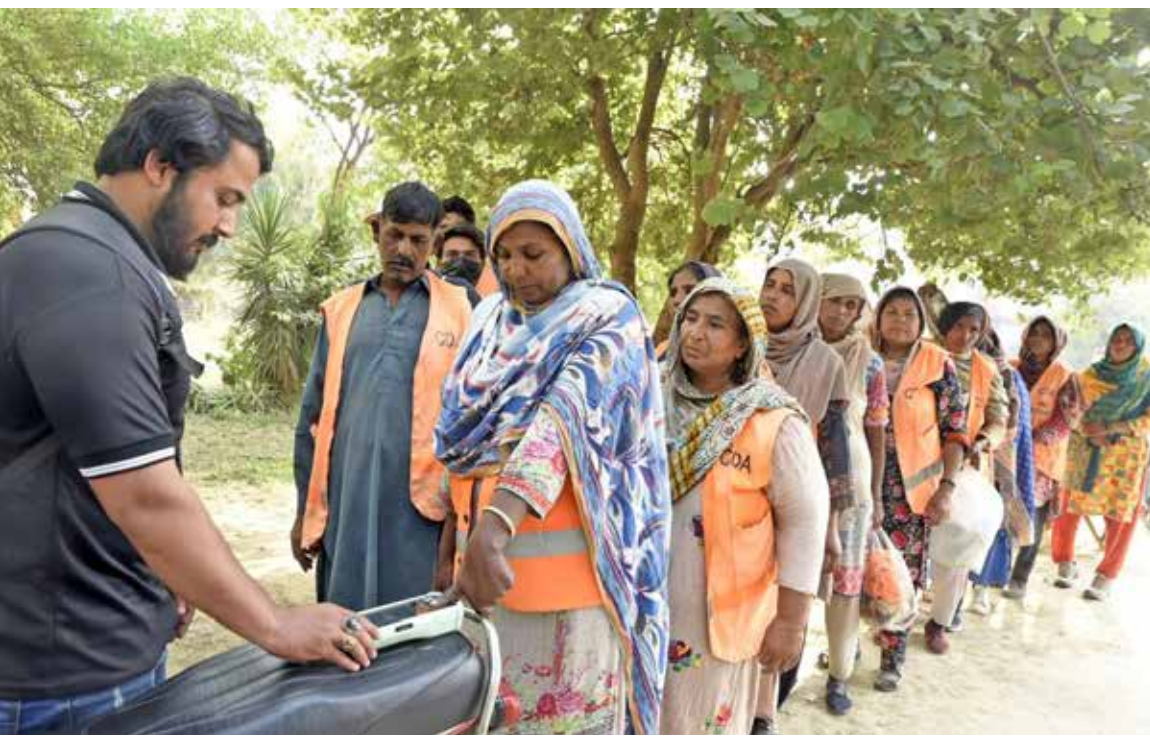
ISLAMABAD: A women sanitary worker provide biometric verification for attendance at sector G-7, in the Federal Capital. Capital Development Authority (CDA) has decided to extend biometric attendance system outside for sanitary workers.