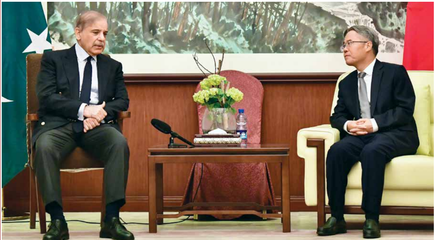
ISLAMABAD: Prime Minister Muhammad Shehbaz Sharif meeting with the Chinese Ambassador to Pakistan H.E Jiang Zaidong during his visit of the Chinese Embassy in Islamabad. The Chinese ambassador, a few days ago had issued a statement raising concerns about the security of the Chinese nationals in Pakistan.