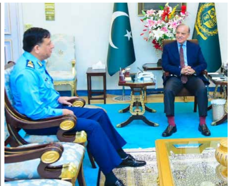
ISLAMABAD: Chief of Air Staff Air Chief Marshal Zaheer Ahmad Babar Sidhu called on Prime Minister Shehbaz Sharif in Islamabad.