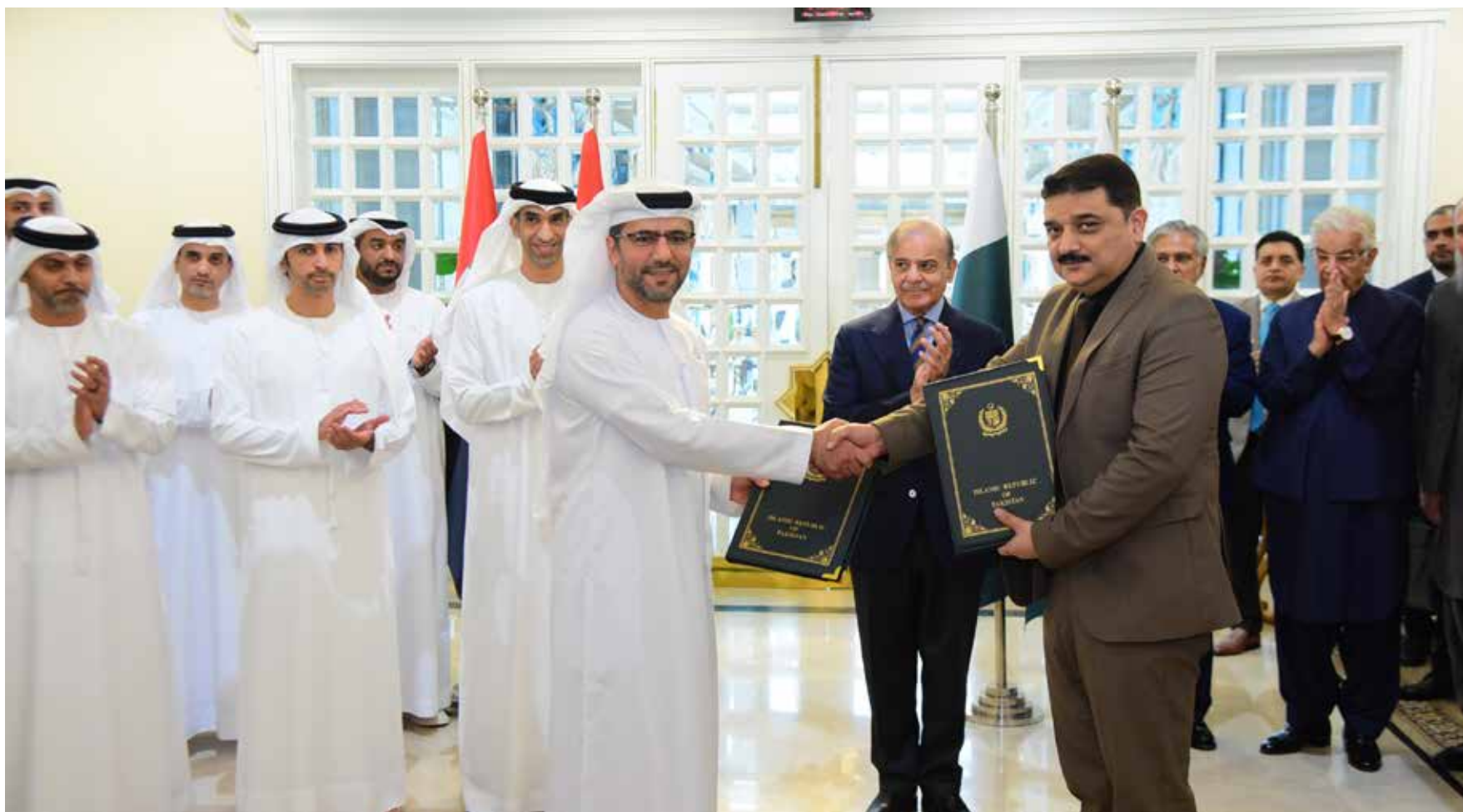
ISLAMABAD: Prime Minister Muhammad Shehbaz Sharif witnessing exchange of MoUs between Pakistan and Abu Dhabi Ports.

NEW DELHI: India's capital unveiled plans Friday to fly special drones to clear pollution from its smog-choked skies — a plan derided by experts as another "band-aid" solution to a public health crisis. New Delhi and the surrounding metropolitan area, home to more than 30 million people, consistently tops world rankings for air pollution in winter. The smog is blamed for thousands of premature deaths each year and is an annual source of misery for the capital's residents, with various piecemeal government initiatives failing to measurably address the problem. Friday marked the start of a trial for an aerial drone tasked with flying around the city's pollution hotspots to spray water mist in an effort to clear dust and harmful particulate matter from the air. "We have been examining different technological solutions and best practices from across the world," Delhi environment minister Gopal Rai said after launching the initiative. "This one drone is part of a pilot project by a company. We will study, and if it succeeds, we will take this forward." Rai said that once the trial was over, the Delhi government would issue a tender to purchase two more drones. If implemented, the three drones would be responsible for mitigating air pollution across a city that stretches across 1,500 square kilometres (580 square miles) — around the same size as greater London.—APP