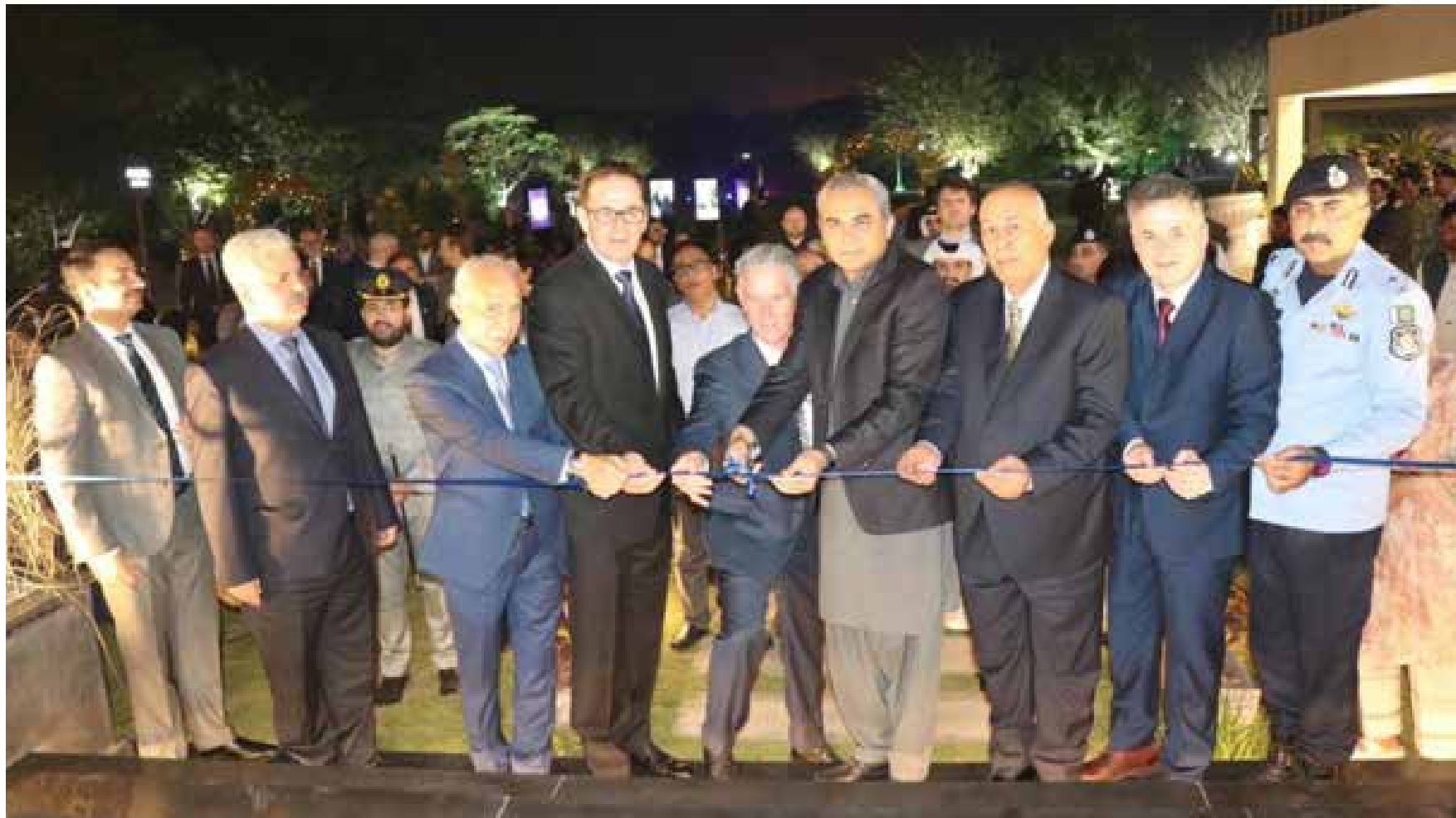
ISLAMABAD: Federal Minister for Interior Mohsin Naqvi inaugurating Casade Facilitation Center in Diplomatic Enclave Islamabad.

In addition, Senator Rubina Khalid announced the forthcoming launch of the Benazir Hunarmand Program, aimed at providing skill development opportunities to deserving women and their families. This program seeks to enhance the economic conditions of eligible families while creating space for new beneficiaries. She also mentioned the Benazir Taleemi Wazaif, which support the children of deserving families, and the Benazir Nashonuma Program, which provides financial assistance and nutritious food to pregnant and lactating mothers and their children. Senator Khalid emphasized that BISP embodies the vision of Shaheed Mohtarma Benazir Bhutto, brought to life by President Asif Ali Zardari.