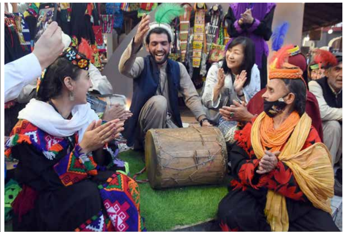
ISLAMABAD: Nov13-Wife of Ambassador of Japan in Islamabad, celebrate during annual Lok Mela, at Lok Virsa, in the Federal Capital.

Emergency Services. During the meeting, Chairman CDA stated that the process of promotion for the officers and employees of CDA need to be expedited, and those who are eligible for promotion, their cases should be considered for promotion. The CDA Board also decided that cyber security firm will be engaged under a running contract to safeguard digital in-