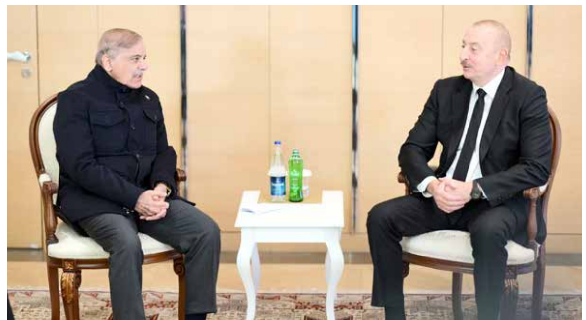
BAKU: Prime Minister Muhammad Shehbaz Sharif meets President of Azerbaijan Ilham Aliyev on the sidelines of COP29 Climate Action.