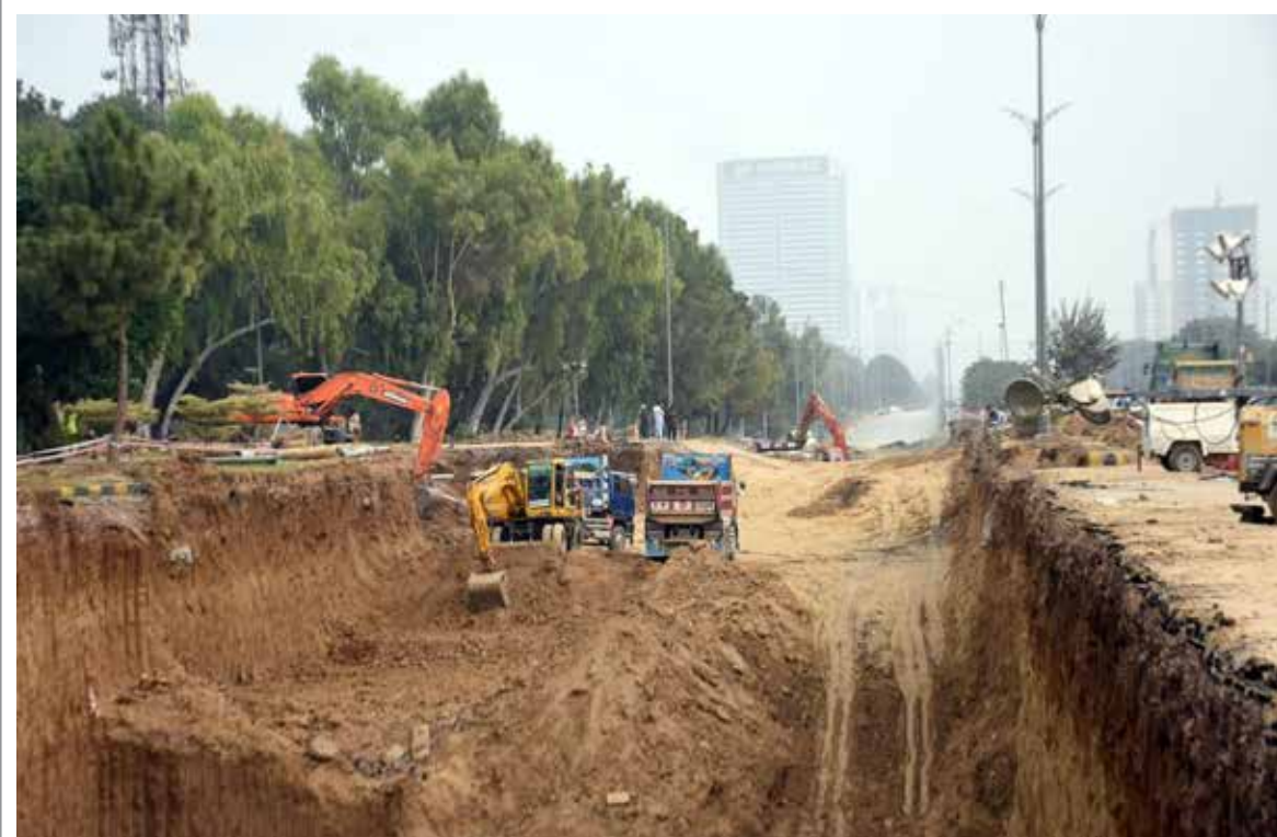
ISLAMABAD: Construction work on Jinnah Avenue Flyover and Underpass simultaneously kicked off in the Federal Capital.

RAWALPINDI: Anti-Narcotics Force (ANF) while conducting six operations recovered over 41 kg of drugs worth Rs 4.4 million and arrested four accused, said an ANF Headquarters spokesman on Thursday. He informed that 1 kg hashish was recovered from the possession of an accused arrested in Baldia Town, Karachi. The arrested accused confessed to selling drugs to the students of educational institutions. In another operation, 584 grams of heroin was recovered from the trolley bag of a passenger going to Bahrain at Lahore International Airport. 24 kg hashish was recovered from a parcel booked for Karachi and Lahore at a courier office in Peshawar.—APP