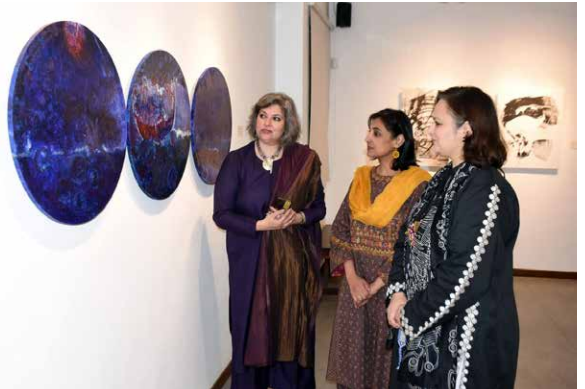
ISLAMABAD: People visiting an Exhibition in the Federal Capital.

Low-cost air quality sensors measure pollutants like PM1.0, PM2.5, NO2, SO2, and O3 and can help identify pollution hotspots across the country. WWF-Pakistan strongly recommends the widespread use of these sensors to monitor air quality to inform smog-control measures. "The urgency of the situation cannot be overstated, as it directly impacts the health of millions of Pakistanis", the letter stated. WWF-Pakistan and its associated team of environmental experts have been closely monitoring the situation, its causes, and its impact, and previously published a comprehensive set of recommendations to address the issue before it reached its current, critical state. With the onset of the autumn season, smog has become the most pervasive environmental and health concern for the citizens of Pakistan. In collaboration with the IQAir Foundation, WWF-Pakistan is currently operating the largest network of low-cost air quality monitoring devices in the country, covering 15 cities. These devices have repeatedly reported AQI levels exceeding 1,000 in several cities in Punjab, with particulate matter regularly surpassing WHO guidelines by 30-40 times.