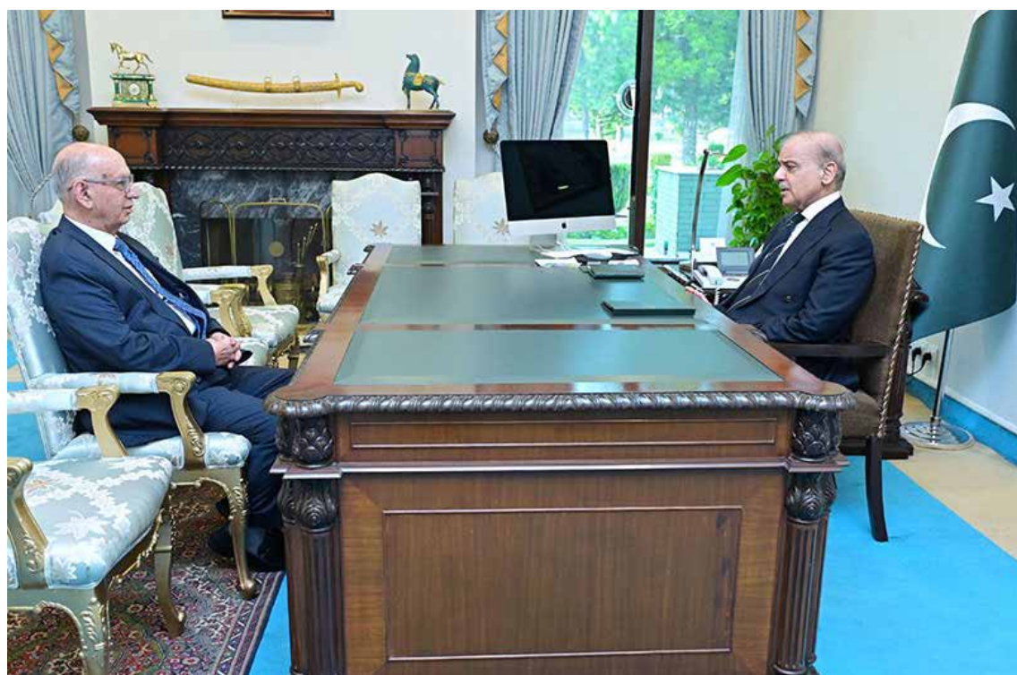
ISLAMABAD: Senator Irfan Siddiqui called on Prime Minister Muhammad Shehbaz Sharif.