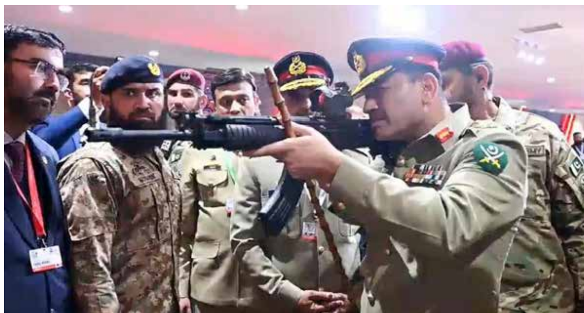
KARACHI: General Syed Asim Munir, NI (M) Chief of Army Staff (COAS) observing display of arms during his visit of the International Defence Exhibition and Seminar (IDEAS-2024).