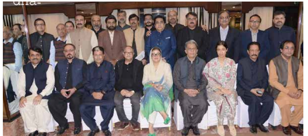
LAHORE: Members of the Executive Committee of the APNS in a group photo with Punjab Information Minister Azma Bukhari. The minister briefed the members about challenges facing the print media industry.

worldwide, continues to attract participants from over 50 countries. NADRA's presence at the event highlights Pakistan's strides in home-grown technological advancements and opens avenues for international collaborations in the biometric sector. The exhibition will continue until November 25, with NADRA's booth drawing keen interest from defense and tech industry representatives eager to explore the integration of biometric systems into their operations.