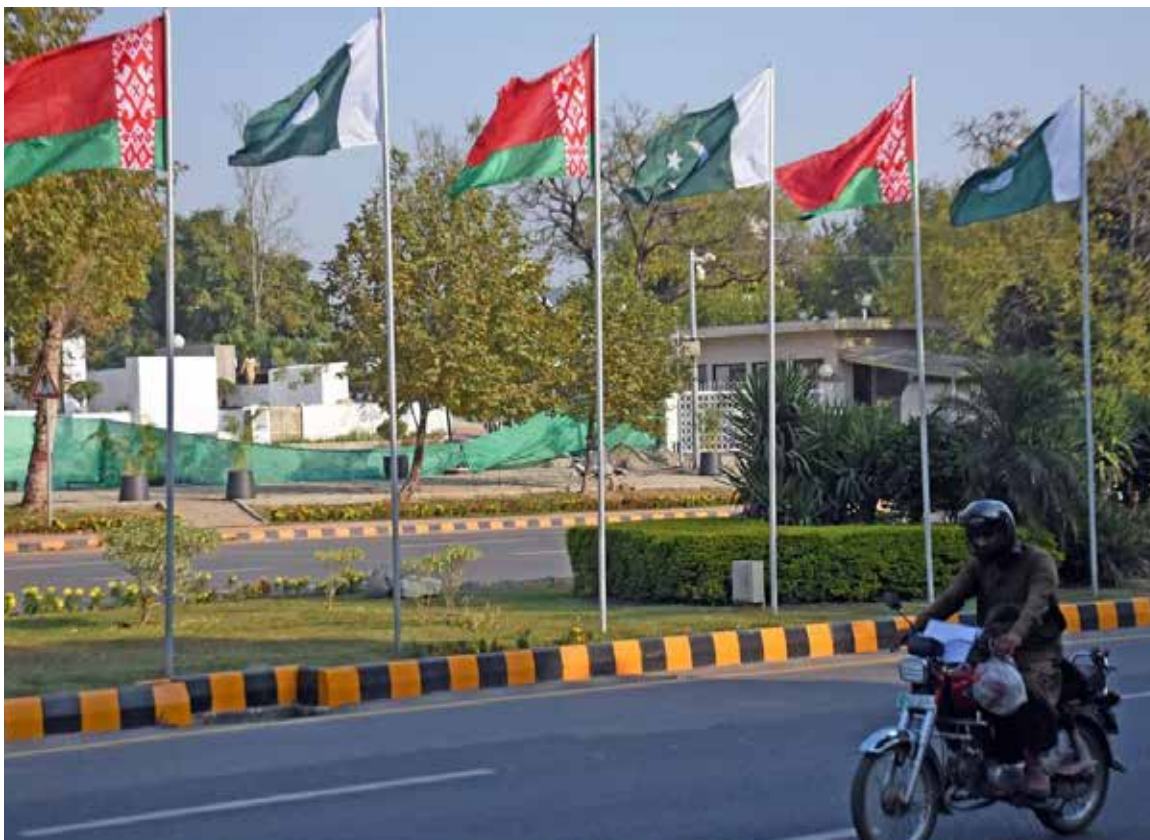
ISLAMABAD: National flags of Pakistan and Belarus hanging on poles along constitution avenue in connection with the 3 day visit of President of Republic of Belarus Aleksandr Lukashenko to Pakistan.