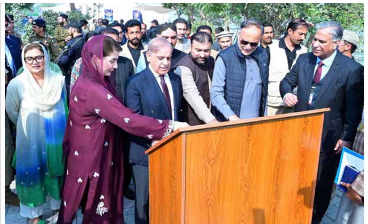
TAUNSA BARRAGE/ KOT ADDU: Prime Minister Muhammad Shehbaz Sharif presses the button to open gates for flow of water from Indus River into Kachhi Canal.