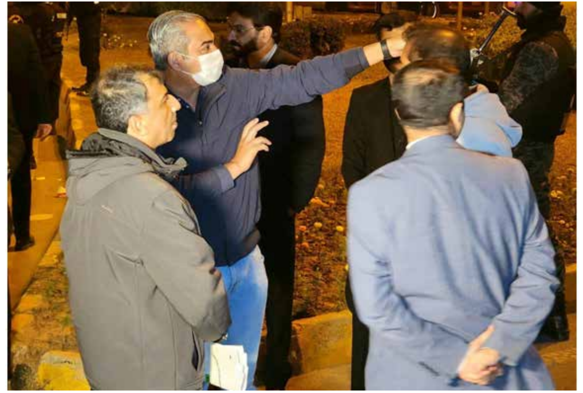
ISLAMABAD: Interior Minister Mohsin Naqvi inspecting the ongoing construction work on F-8 Exchange Chowk Interchange