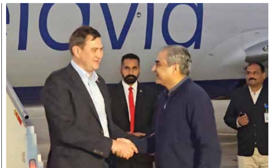
ISLAMABAD: Federal Minister for Interior Mohsin Naqvi receiving High level Belarusian Delegation on their arrival in Islamabad.

RAWALPINDI: Three hardened terrorists associated with Fitna al Khawarij were killed during an intelligence-based operation conducted by the Counter Terrorism Department (CTD) in the Chakri area of Rawalpindi. According to a CTD spokesperson, the team launched the operation based on credible intelligence about the presence of terrorists in the area. Upon arrival, the militants opened indiscriminate fire on the CTD personnel, triggering a heavy exchange of gunfire. The spokesperson revealed that three terrorists were killed during the encounter, reportedly by the firing of their own associates. However, two militants managed to escape, prompting the CTD to launch a search operation in the surrounding areas. The operation uncovered a large cache of weapons and explosives, including a suicide jacket, safety-fuse wire, rifles, an IED bomb, bullets, and other explosive material. Authorities believe the terrorists were planning to target sensitive locations in Rawalpindi. The CTD has cordoned off the entire Chakri area, and efforts are underway to identify the deceased militants while pursuing the two who fled.