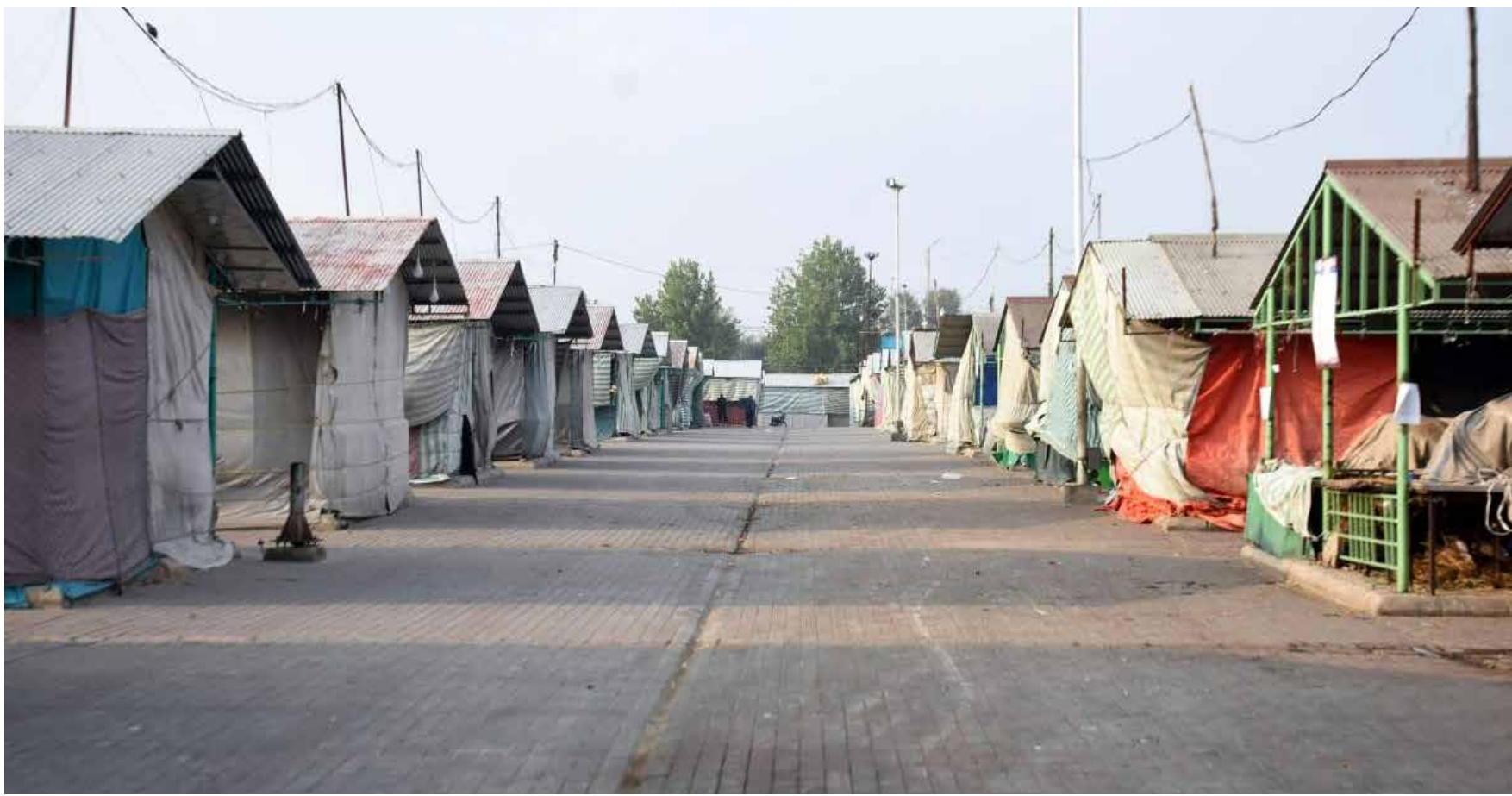
ISLAMABAD: A view of closed Sunday weekly bazaar at sector H-9 due to road closed with shipping containers ahead of PTI protest, in the Federal Capital.

ISLAMABAD: Federal Interior Minister Mohsin Naqvi conducted an aerial visit of Islamabad, Rawalpindi, and Attock to review security arrangements in the three cities. During his visit, Interior Minister took an aerial view of the security arrangements in various areas of three cities. He also observed the overall situation on the Motorway, Swabi, and Pathar Gharh, expressing satisfaction with the security arrangements. Mohsin Naqvi stated that necessary measures have been taken to ensure public peace and order in compliance with the Islamabad High Court's order. He added that police, FC, and Rangers personnel are diligently performing their duties.