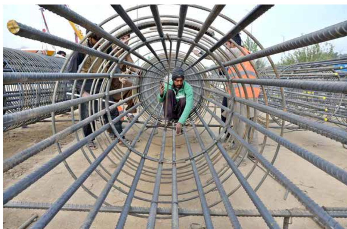
ISLAMABAD: Labourers are busy in work at the site of under-construction PTCL Chowk underpass project during development work in Federal Capital.