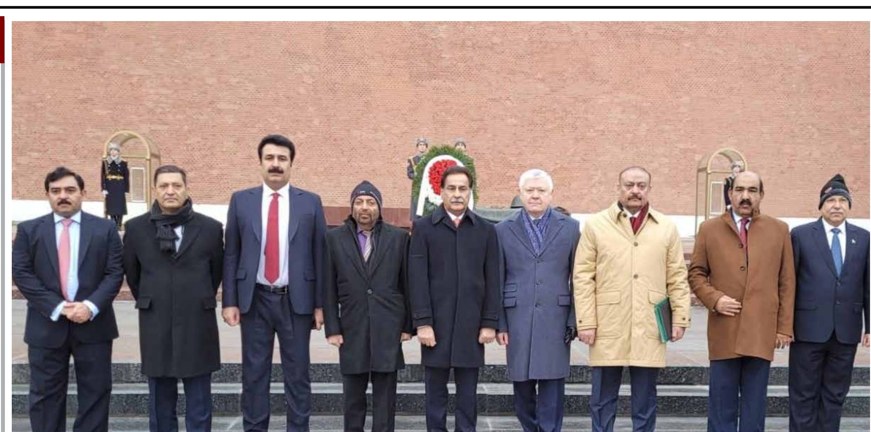
MOSCOW: Speaker National Assembly along with delegation at near Wall of Krem- lin Moscow after laying wreath at the tomb of Unknown Soldier.

TIRANA: Police in Albania's capital Tirana fired tear gas and used water cannon to disperse hundreds of opposition protesters blocking roads, who accused the government of corruption and demanded it be replaced with a technocratic caretaker authority. Protesters said they were engaged in a campaign of civil disobedience against Socialist Party Prime Minister Edi Rama. The opposition in Albania have been protesting almost every week demanding a caretaker government step in until parliamentary elections in 2025.