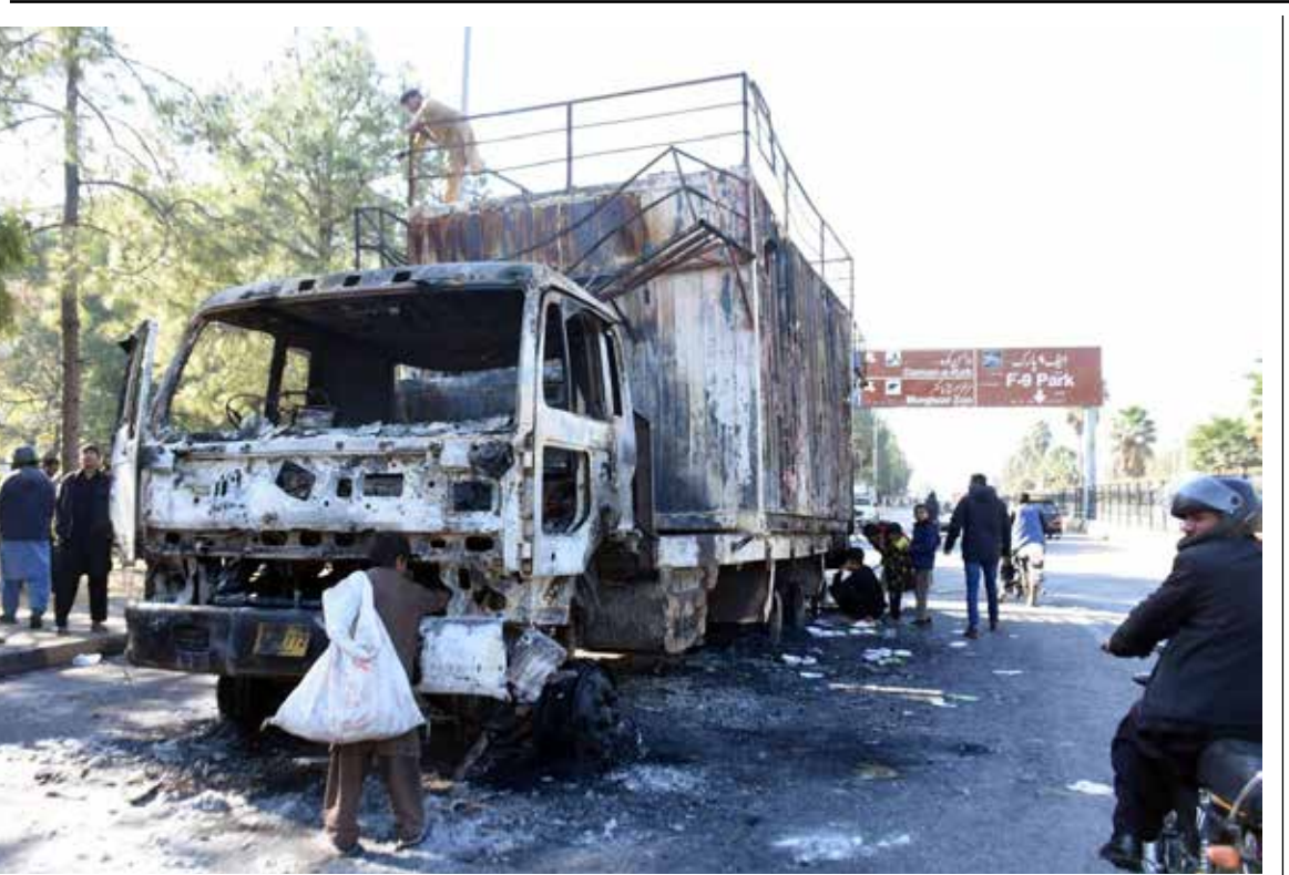
ISLAMABAD: PTI's burned container at Jinnah Avenue in the Federal Capital.