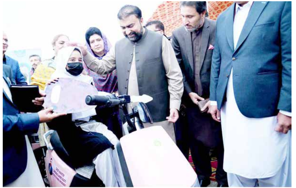
QUETTA: Balochistan Chief Minister Mir Sarfraz Bugti giving Pink Scooties to student of Post Graduate Girls College.

is a gateway to Africa which is a huge market of more than 1.4 billion population, he said while underscoring the significance of the Single Country Exhibition in Addis Ababa which would not only connect the Pakistani traders with the Ethiopian counterparts but also with the African market. On the other hand, the Minister said the Ministry of Commerce, and the Trade Development Authority of Pakistan is making all the necessary preparation regarding the Single Country Exhibition in Addis Ababa. He said the Government of Pakistan is committed to Look Africa and Engage Africa Policy and has been taking all possible steps