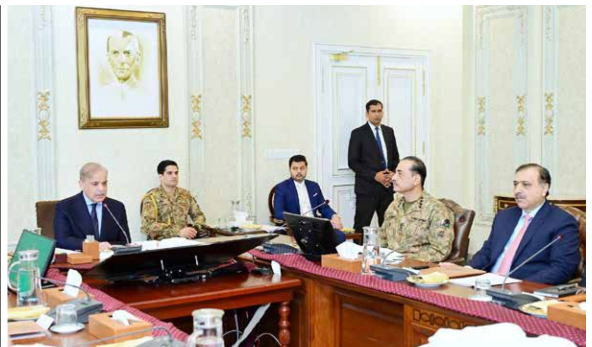
ISLAMABAD: Prime Minister Muhammad Shehbaz Sharif chairs a high level meeting regarding law and order.

ISLAMABAD: The Khunjerab border, a vital land link between Pakistan and China, has been officially closed for all public traffic, trade, and tourism. The route has been closed by both sides for the next four months under a bilateral agreement. The closure, effective from November 30, will remain in place until March 30, 2025, as both countries prepare for harsh winter conditions in the region. Situated at an altitude of approximately 15,500 feet above sea level, the Khunjerab Pass experiences heavy snowfall and extreme weather during winter, making transportation and trade activities challenging. As per a mutual agreement, the Khunjerab border operates seasonally, opening annually from April 1 to November 30 to facilitate trade, tourism, and public traffic. This year, the border was closed a day earlier due to regular weekend holidays on Saturday and Sunday. The border is expected to reopen on April 1, 2025.