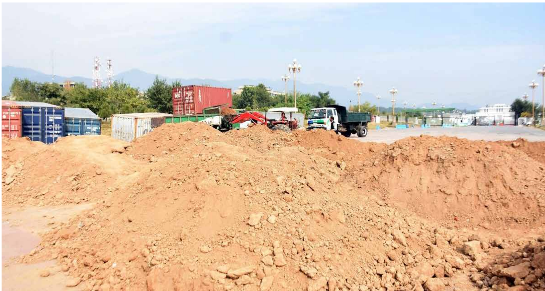
ISLAMABAD: Workers loading clay on a tractor trolley during cleared D-chowk road after being closed for about 5 days due to the PTI protest in the Federal Capital.