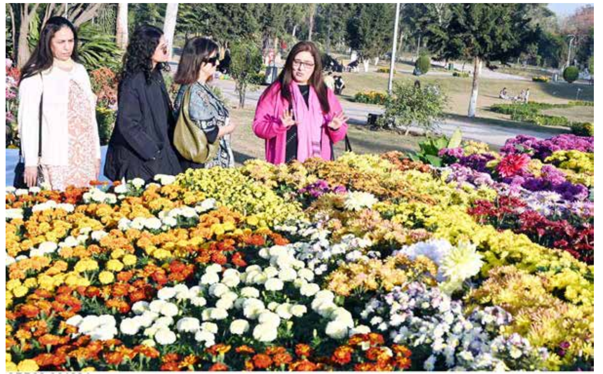
ISLAMABAD: Women admiring the vibrant displays at the 43rd Chrysanthemum Festival and Annual Flower Show, organized by the National Horticultural Society of Pakistan and CDA at Rose and Jasmine Garden.

panel and inverter will be linked to the computerized CNIC of the consumer. Installing 100,000 solar systems in Punjab will reduce carbon emissions by 57,000 tons. Free solar panel scheme will also reduce the burden of subsidy on the federal government. Meanwhile, Punjab Chief Minister Maryam Nawaz Sharif has paid glowing tribute to Major Shabbir Sharif Shaheed on his 53rd martyrdom anniversary. In her message, the CM said Major Shabbir Sharif Shaheed set a great example of courage and bravery, adding that in the 1971 war, Major Shabbir Sharif Shaheed sacrificed his life while showing courage in Sulemanki. The CM said that Major Shabbir Sharif Shaheed is alive as an example of determination and courage, adding that his passion to defend the country is exemplary. The nation is proud of Major Shabbir Sharif Shaheed and all other soldiers who sacrificed their lives for the defence of the homeland, she remarked.