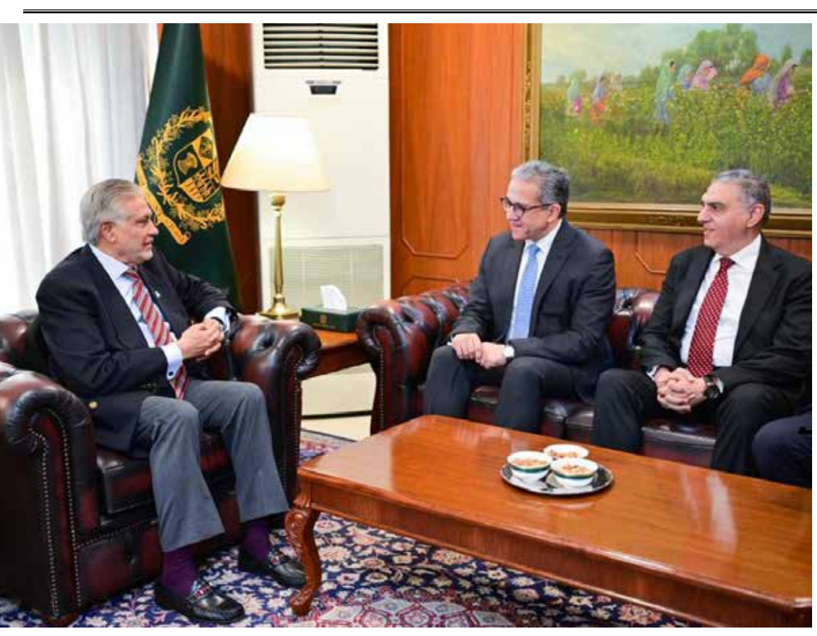
ISLAMABAD: The Deputy Prime Minister/Foreign Minister Mohammad Ishaq Dar received the Egyptian candidate for Director General UNESCO, Dr. Khaled El-Enany. They reaffirmed the historic brotherly ties between Pakistan and Egypt and strong commitment to strengthening these relations. Deputy Prime Minister Dar and Dr. El-Enany discussed the importance of cultural exchanges and cooperation in multilateral platforms including UNESCO.

DELHI: At least 40 schools in India's capital New Delhi received bomb threats via email on Monday, with the sender demanding a payment of $30,000, according to Indian media reports. In response to the threats, police officials have initiated searches at the affected school premises, although no bombs have been found so far. The emails threatened detonate explosives unless the specified ransom was paid. Authorities have not yet confirmed whether the threats are genuine or part of a hoax. The bomb threats come amid a troubling increase in similar incidents across India in recent months, including hoaxes targeting schools, airports, and railway stations. In light of the threats, parents were seen picking up their children from schools as a precautionary measure. The Delhi Police are working to trace the origin of the emails and identify those responsible for the threats.-Agencies