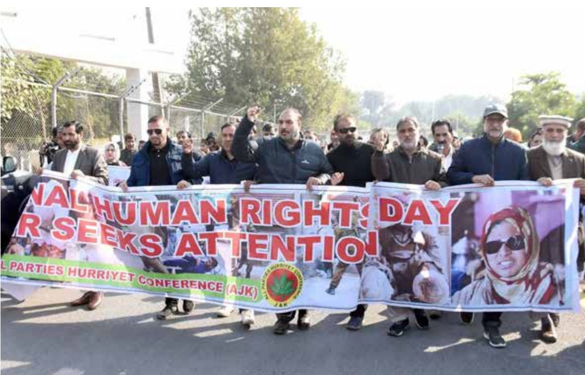
ISLAMABAD: Dec10-Activists of All Parties Hurriyat Conference (APHC) hold a banner and shouting slogans during protest against Indian Army on the eve of International Human Rights Day, near UNO office at Shamash gate, in the Federal Capital.

ISLAMABAD: Pakistan Telecommunication Authority (PTA) has launched Cybersecurity Awareness Week 2024, which will run from December 9 to 15. This week-long initiative aims to bolster awareness of digital safety at the individual and consumer levels. It will focus on online security, data privacy, and the legal aspects of cybercrimes under the Prevention of Electronic Crimes Act (PECA) 2016. According to a news release, the PTA will host expert discussions to equip individuals and organizations with essential knowledge to protect themselves from emerging cyber threats. PTA invites citizens, businesses, and educational institutions to participate and strengthen Pakistan's cybersecurity environment by following our social media handles and posting and resharing our content.—APP