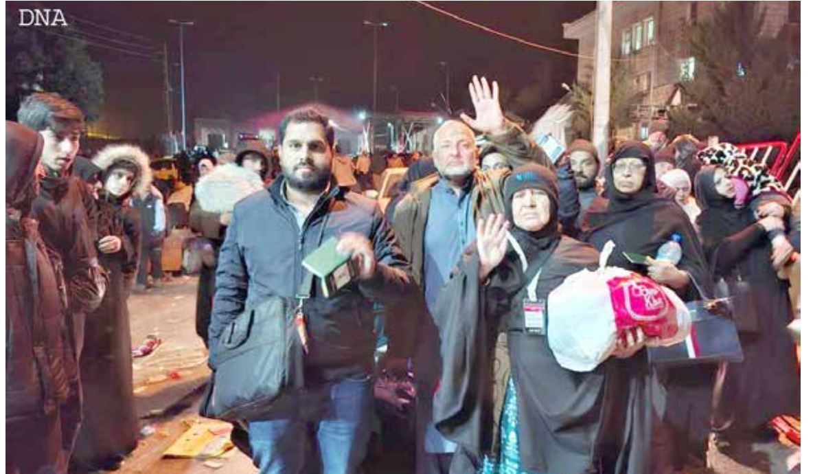
ISLAMABAD: Around 350 Pakistani nationals including 245 Pakistani Zaireen stranded in Syria have crossed the Syria-Lebanon border. Pakistan government has made arrangements for their evacuation.

Over 300 Israeli strikes since Assad's fall