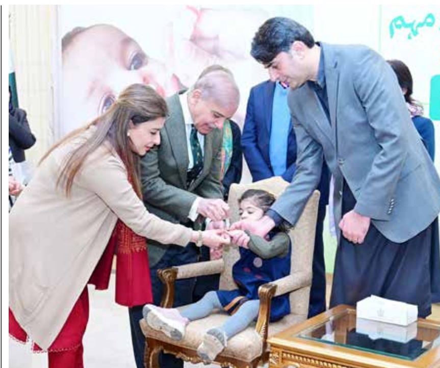
ISLAMABAD: Prime Minister Muhammad Shehbaz Sharif addressing the launching ceremony of the last Anti-Polio Campaign 2024. - DNA

SKARDU: At least five people died after their vehicle was struck by a landslide near Rondo Malupa in Skardu on Sunday afternoon. According to rescue sources, the ill-fated vehicle was travelling from Skardu to Shangus when it was suddenly buried under a massive amount of falling debris, private news channels reported. Police described the scene as "horrific" as the vehicle was swept away by the landslide, leaving no chance of escape for the occupants. A rescue team was immediately dispatched to the scene to launch a search and rescue operation. As the rescue operation continued, officials confirmed that at least five people had lost their lives in the tragedy. The identities of the victims have not been released yet.