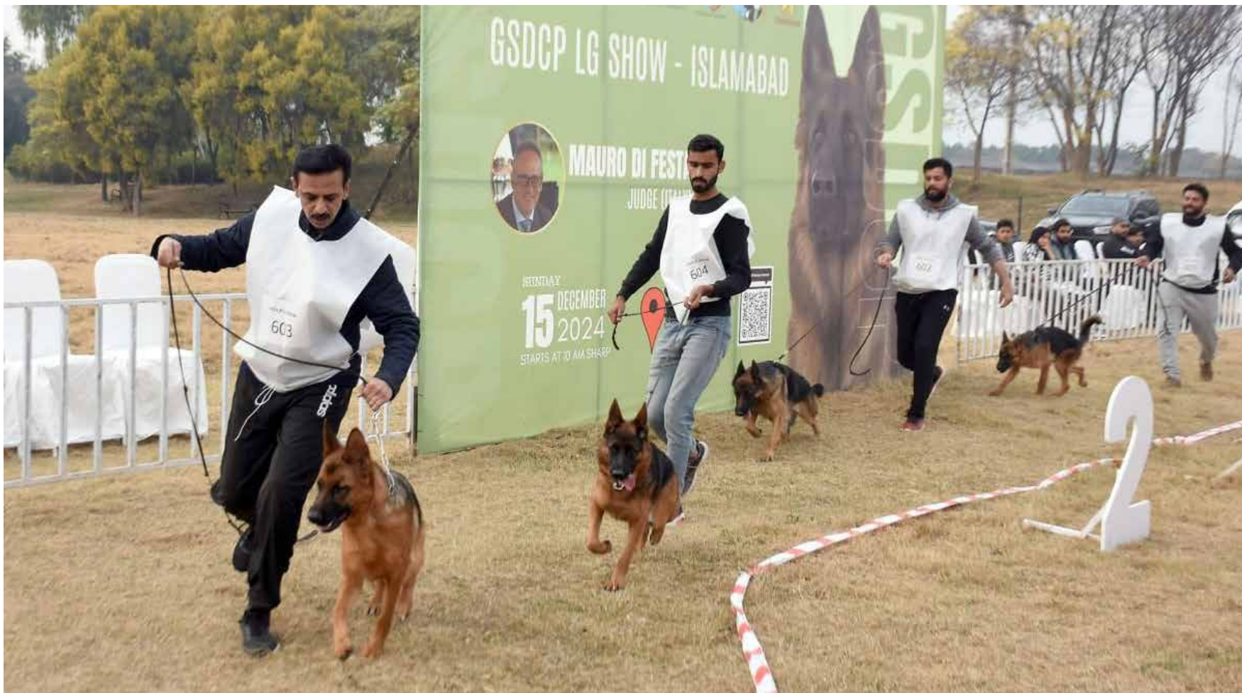
ISLAMABAD: Participants walking with their dogs during FCI CACIB show, at F-9 Park, in the Federal Capital.

FROM PAGE 01 The prime minister instructed Interior Minister Mohsin Naqvi to submit an inquiry report of the incident as soon as possible. He said concrete steps should be taken to prevent such incidents in future. Shehbaz Sharif said human trafficking is a heinous crime that claims many lives and destroys many homes every year. He said human traffickers are a cruel mafia which extorts money from poor people by showing them false dreams. Shehbaz Sharif said such people should be identified and punished severely so that they may not repeat such heinous acts. On the directions of Prime Minister Muhammad Shehbaz Sharif, a special cell has been established at the Pakistani Embassy in Greece to address the emergency situation, arising out due to boat capsizing incident. The special cell will ensure the identity of the Pakistanis and the access of their relatives to their loved ones. As many as 47 Pakistanis, affected in yesterday's boat sinking incident, have been identified and rescued.