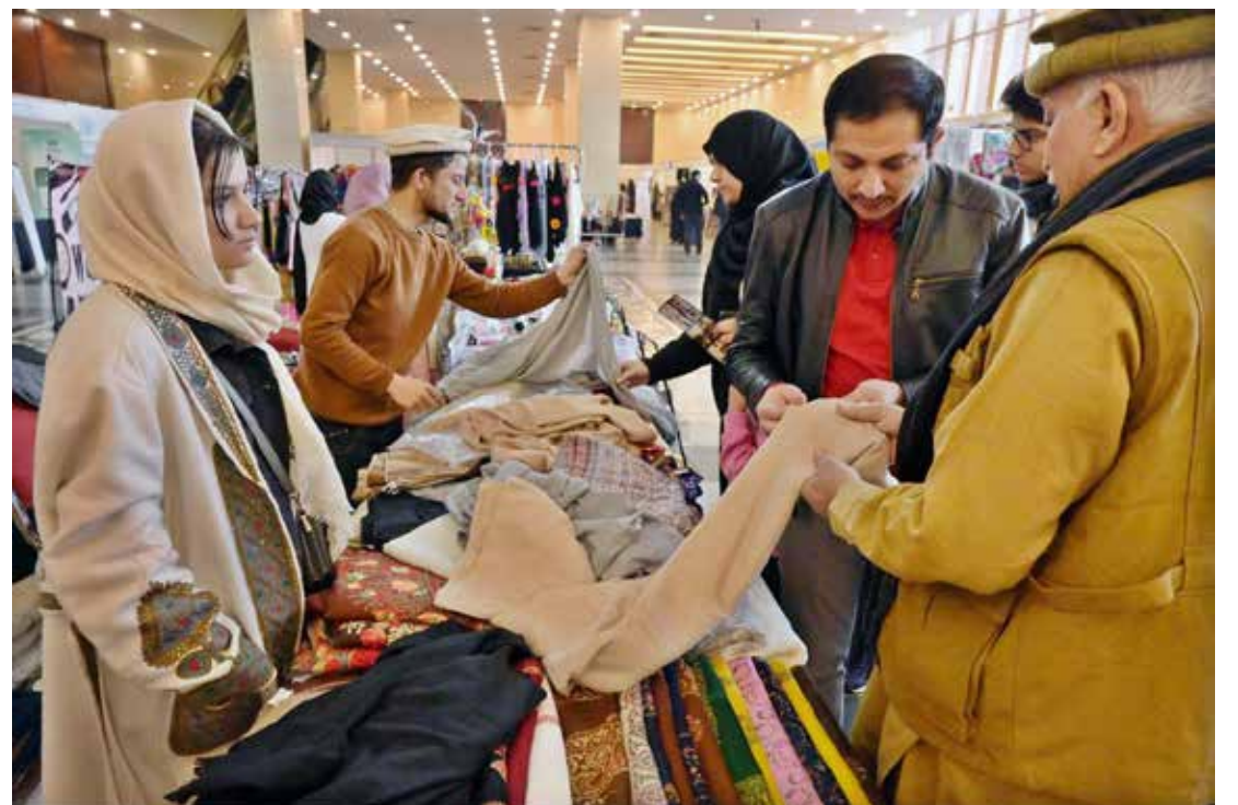
ISLAMABAD: Visitors looking different handmade items displayed on stall during the Islamabad Women Gala at Pak-China Center in the Federal Capital.

workshops, seminars and other projects at the district level to educate the public. Additionally, special sessions are being organized in schools to sensitize the younger generation about the prevention and management of these diseases, he mentioned. Gondal also emphasized the crucial role of community involvement in combating TB, Dengue and Polio. He acknowledged the government's efforts but stressed that community participation is vital in achieving success. Punjab's remarkable progress in reducing Polio cases serves as a testament to the power of collective action. By working together, we can make significant strides in controlling and preventing these diseases, he added. He stressed the importance of people's awareness on population control, stressing that family planning is crucial in ensuring that the population growth aligns with available resources. He noted that excessive population growth is not in line with the World Health Organization's (WHO) recommended GDP growth rate of 5%. This highlights the need for sustainable population growth to ensure economic stability and development, he concluded.