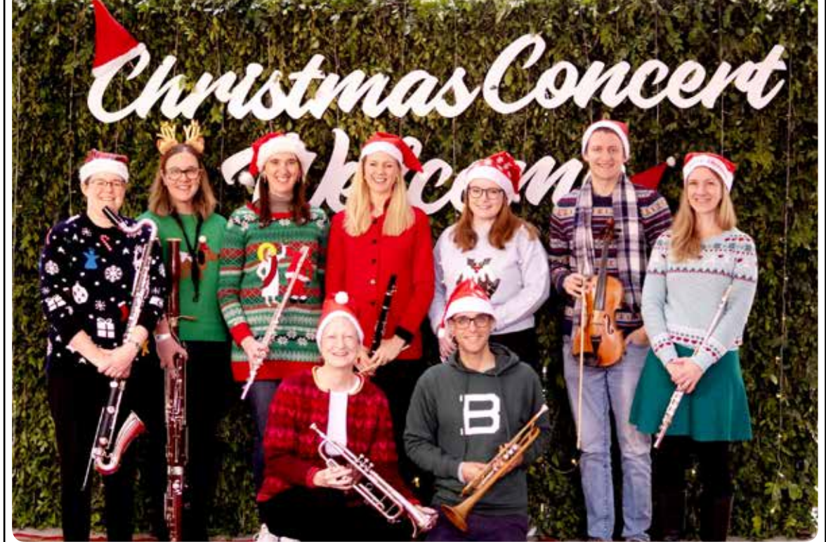
ISLAMABAD: EU Ambassador to Pakistan Riina Kionka in a group photo with diplomatic music band, which performed on the occasion of Christmas festivities.