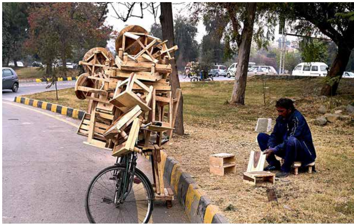
ISLAMABAD: An artisan crafts and sell wooden benches on the roadside while displaying at G-8 in the Federal Capital.

ISLAMABAD: The Islamabad Traffic Police (ITP) has issued over 56,000 fine tickets to motorcyclists for riding without helmets during the ongoing year. A police spokesperson told APP on Sunday that the ITP strives to maintain an exemplary traffic system in the city while ensuring strict action against negligence on the roads. All officers have been directed to enforce traffic rules and regulations without discrimination, demonstrating patience and politeness when issuing tickets to violators, he said. He added that the ITP is utilizing all available resources to facilitate the public on the capital's roads and has urged parents not to permit underage children to drive bikes or cars before reaching maturity.—APP