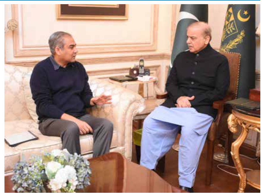
LAHORE: Federal Minister for Interior Syed Mohsin Raza Naqvi calls on Prime Minister Muhammad Shehbaz Sharif. — DNA