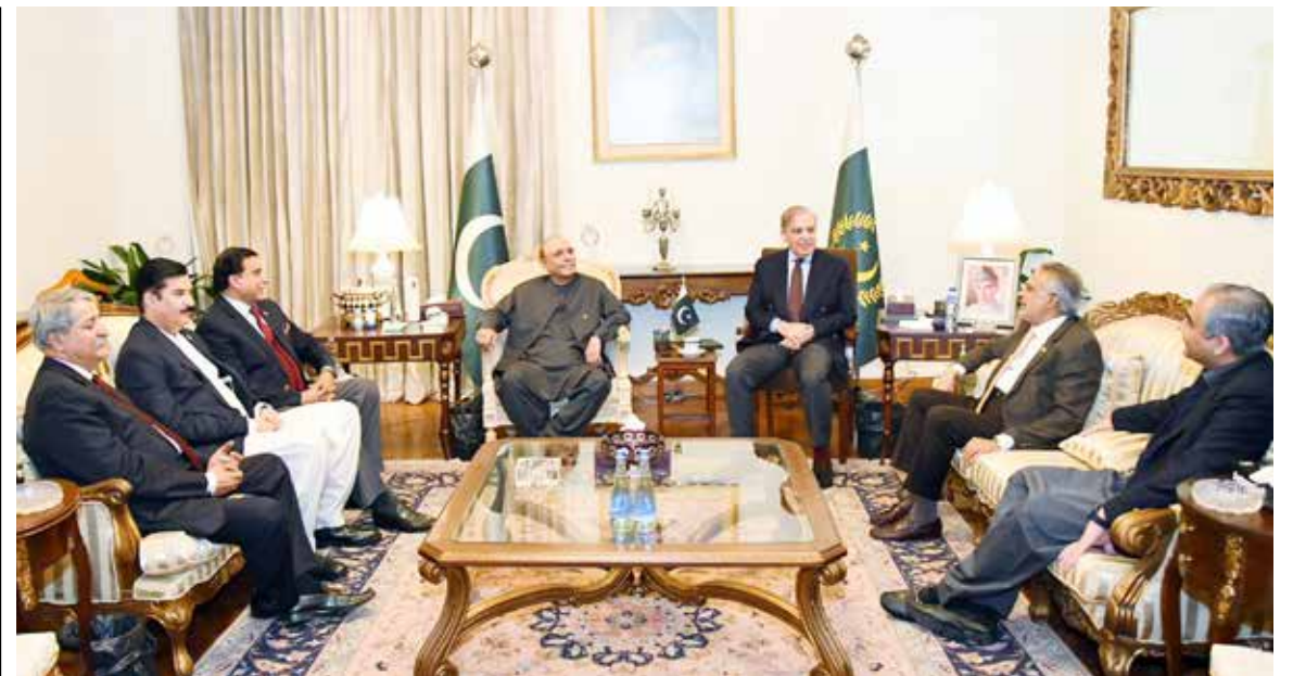
ISLAMABAD: President Asif Ali Zardari and Prime Minister Shehbaz Sharif hold meeting at Aiwan-e-Sadr.