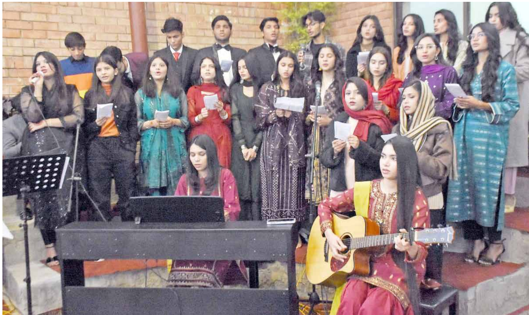
ISLAMABAD: Pakistani Christians take part in Christmas Day mass at St. Thomas Church, in the Federal Capital.

"I think of the Christian communities in Israel and Palestine, particularly in Gaza, where the humanitarian situation is extremely grave. May there be a ceasefire, may the hostages be released and aid be given to the people worn out by hunger and by war," he added. Francis extended his call for a silencing of arms to the whole Middle East and to Sudan, which has been ravaged by a ravaged by 20 months of brutal civil war where millions are under the threat of famine. "May the Son of the Most High sustain the efforts of the international community to facilitate access to humanitarian aid for the civilian population of Sudan and to initiate new negotiations for a ceasefire," he said.—APP