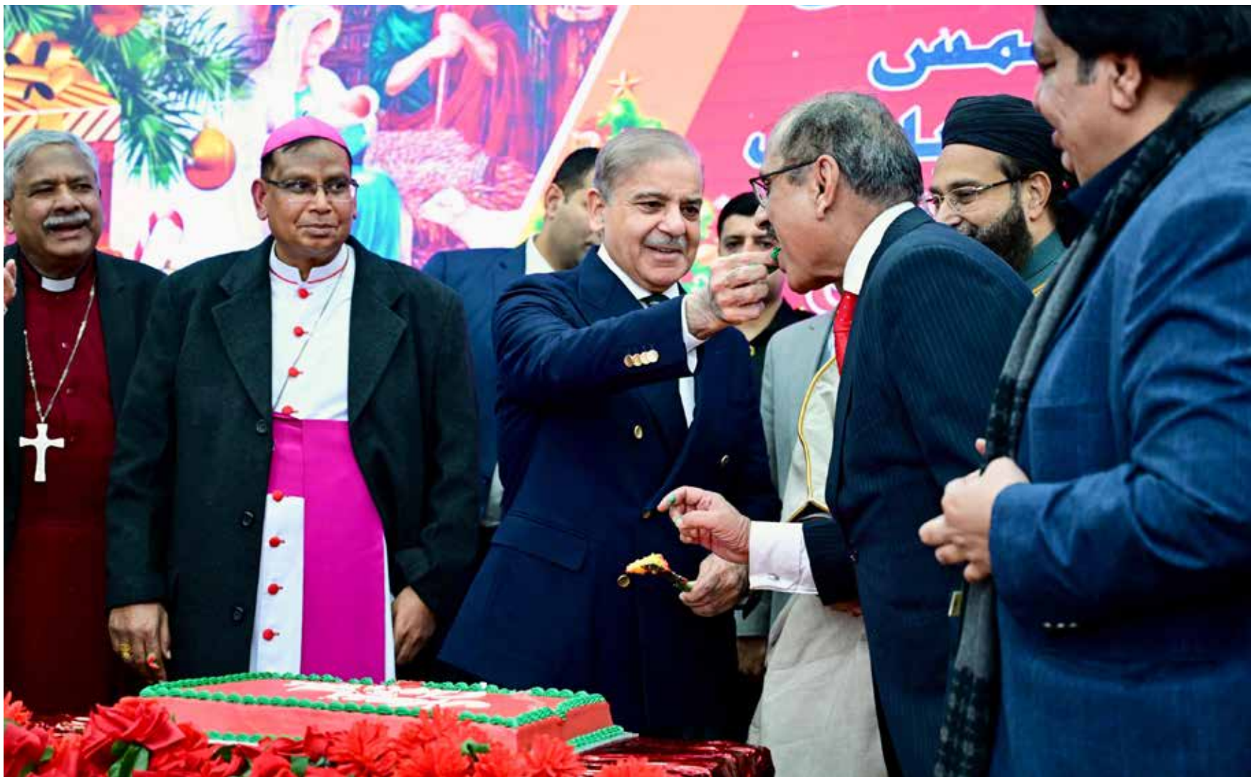
ISLAMABAD: Prime Minister Muhammad Shehbaz Sharif cuts a cake to celebrate Christmas 2024.

"May the sound of arms be silenced in war-torn Ukraine," the 88-year-old pontiff said, his voice strained and breathless. "May there be the boldness needed to open the door to negotiation and to gestures of dialogue and encounter, in order to achieve a just and lasting peace." In front of thousands of the faithful gathered in front of St. Peter's Basilica in Rome, also appealed for a ceasefire in Gaza and for the freeing of Israeli hostages held there by Hamas. "I think of the Christian communities in Israel and Palestine, particularly in Gaza, where the humanitarian situation is extremely grave. May there be a ceasefire, may the hostages be released and aid be given to the people worn out by hunger and by war," he added. - Agencies