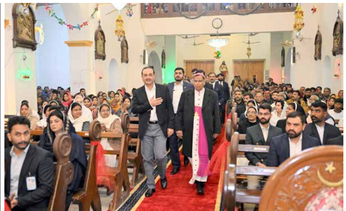
RAWALPINDI: Chief of Army Staff (COAS) General Syed Asim Munir, joined the Christian community in celebrating Christmas at St. Joseph's Catholic Cathedral Church.

PM expressed grief Azerbaijan plane crashes in Kazakhstan