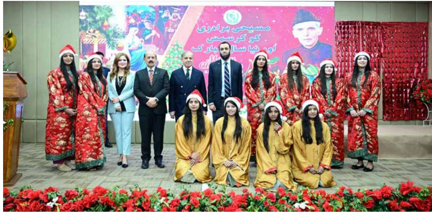
ISLAMABAD: Prime Minister Muhammad Shehbaz Sharif with a choir group that performed at a ceremony in the Prime Minister's House to celebrate Christmas.

ISLAMABAD: Federal Minister for Information, Broadcasting, National Heritage and Culture Attaullah Tarar said Wednesday that the Christian community has rendered immense sacrifices and services for Pakistan. Delivering his speech at a special event organized on the occasion of Christmas here, he said the Christian community also played a prominent role in the Pakistan Movement. The Christian community, he said was advancing the Prime Minister's vision of development and progress. Wishing Merry Christmas to Christian brothers and sisters, he said he was glad to represent 70 thousand Christians in his constituency. "During the election campaign, I received immense love and affection from the Christian community in my constituency," he remarked. The minister said that the white colour in the national flag represented minorities and the Christian community has always kept the flag high. He said the body of