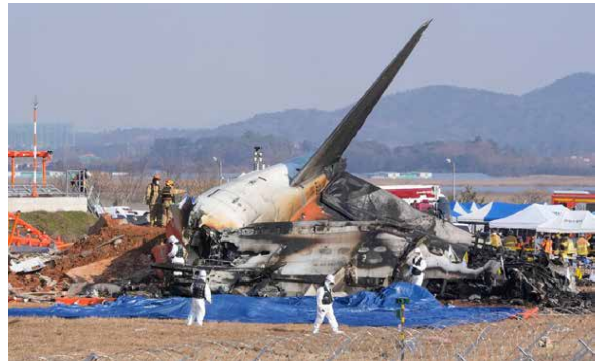
MUAN-GUN: Firefighters and rescue team members work near the wreckage of a passenger plane at Muan International Airport.