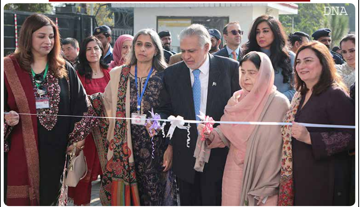
ISLAMABAD: Deputy Prime Minister and Foreign Minister Ishaq Dar inaugurates the Pakistan Foreign Office Women Association (PFOWA) Annual Charity Bazaar 2024. (More pictures and news on BackPage). - DNA