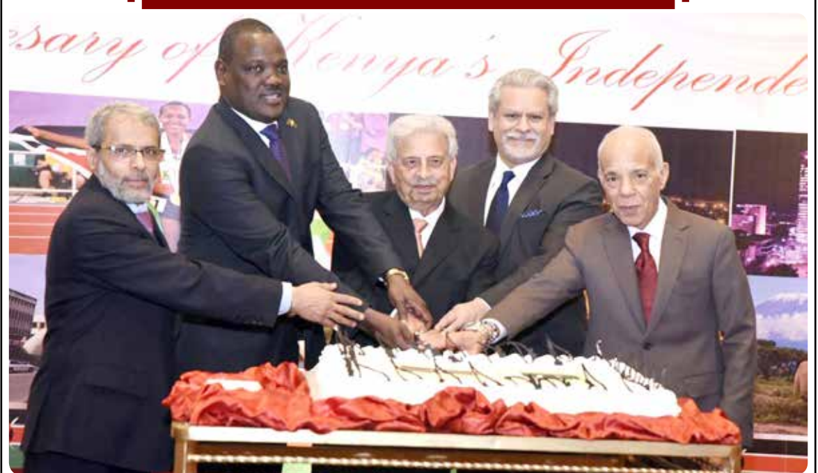
ISLAMABAD: Federal Minister for Industries Rana Tanveer Hussain, Dean of the African Group Mohamad Karmoune Ambassador of Morocco, High Commissioner of Kenya and others cutting cake to celebrate the Independence Day of Kenya.

341 terrorists killed in 12801 IBOs, NA told