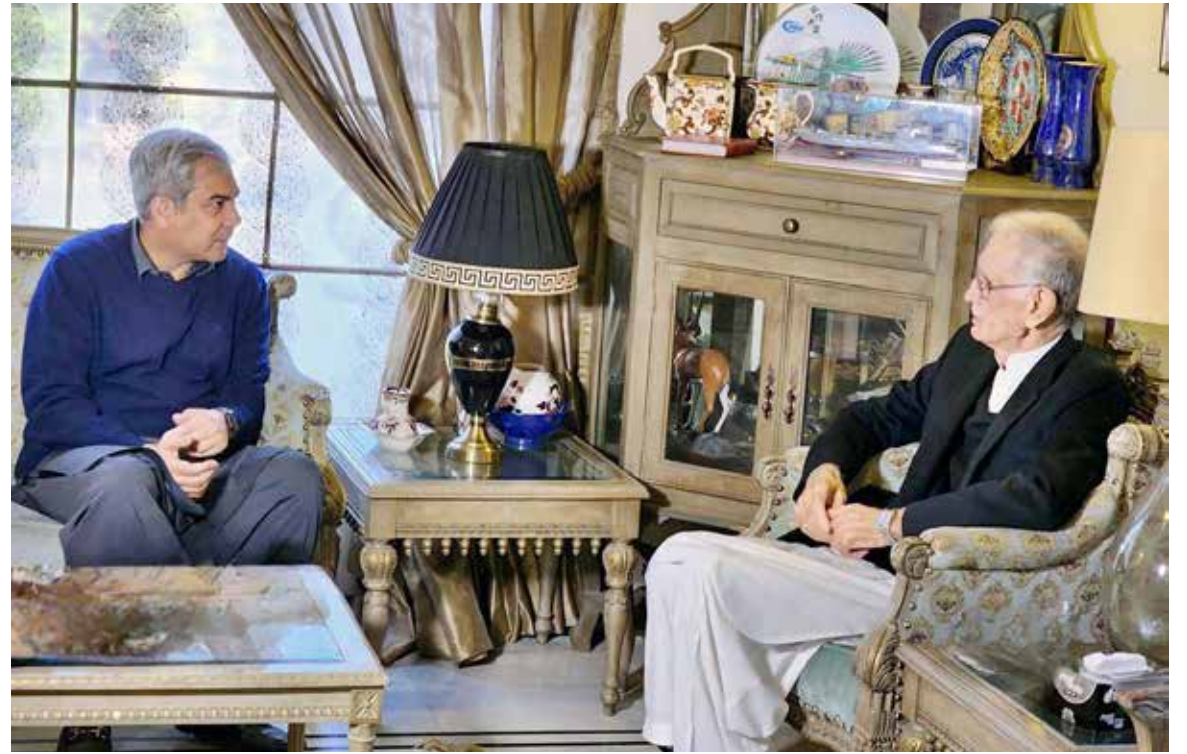
ISLAMABAD: Interior Minister Mohsin Naqvi met founder of Pakistan Tehreek-e-Insaf Parliamentarians Pervez Khattak to discuss pressing national issues.

Quran, Prophet (PBUH) real guidance for all of us: Governor